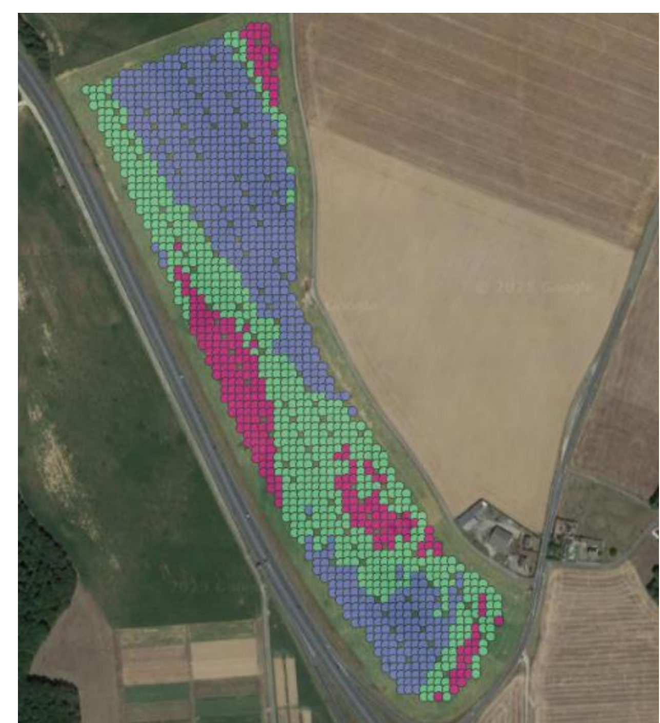
Figure 2. Three zones represent spatial variability in soil properties identified through sensor data and clustering analysis