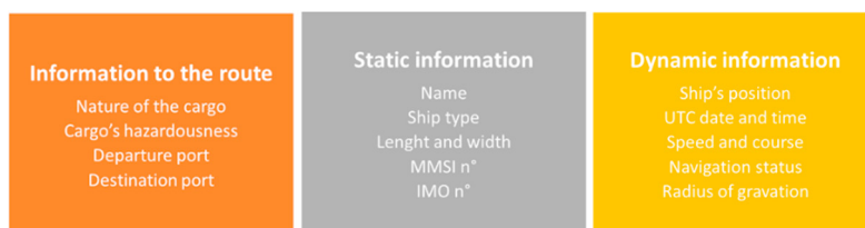
Fig. 1. Nature of AIS data.