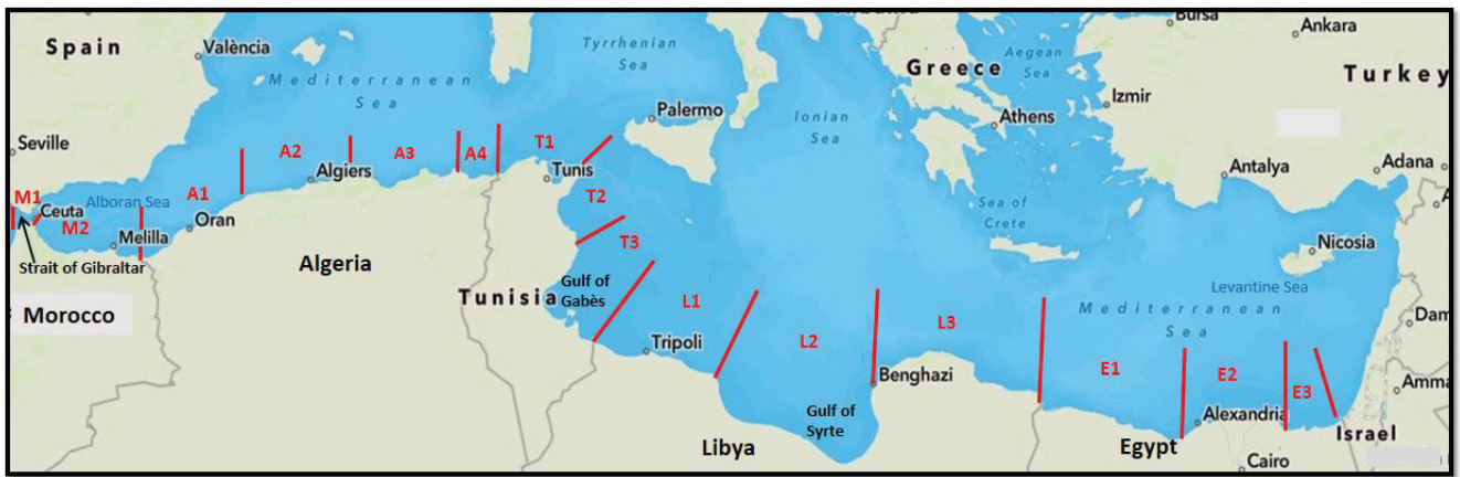
Fig. 1: Limits of the 15 sectors for the five countries bordering the Southern Mediterranean Sea.

coast, the amphipods recorded in these enclaves had been included in our study, as they are linked biogeographically to the nearest North African coast, i.e., the Moroccan Mediterranean coast. Ceuta is included in sector M1, and Melilla and the Chafarinas Islands in sector M2. On the list of Moroccan amphipods (Appendix B Morocco), in the “First signalisation” column, the name of authors whose works has been carried out in the Spanish enclaves of North Africa is in bold.