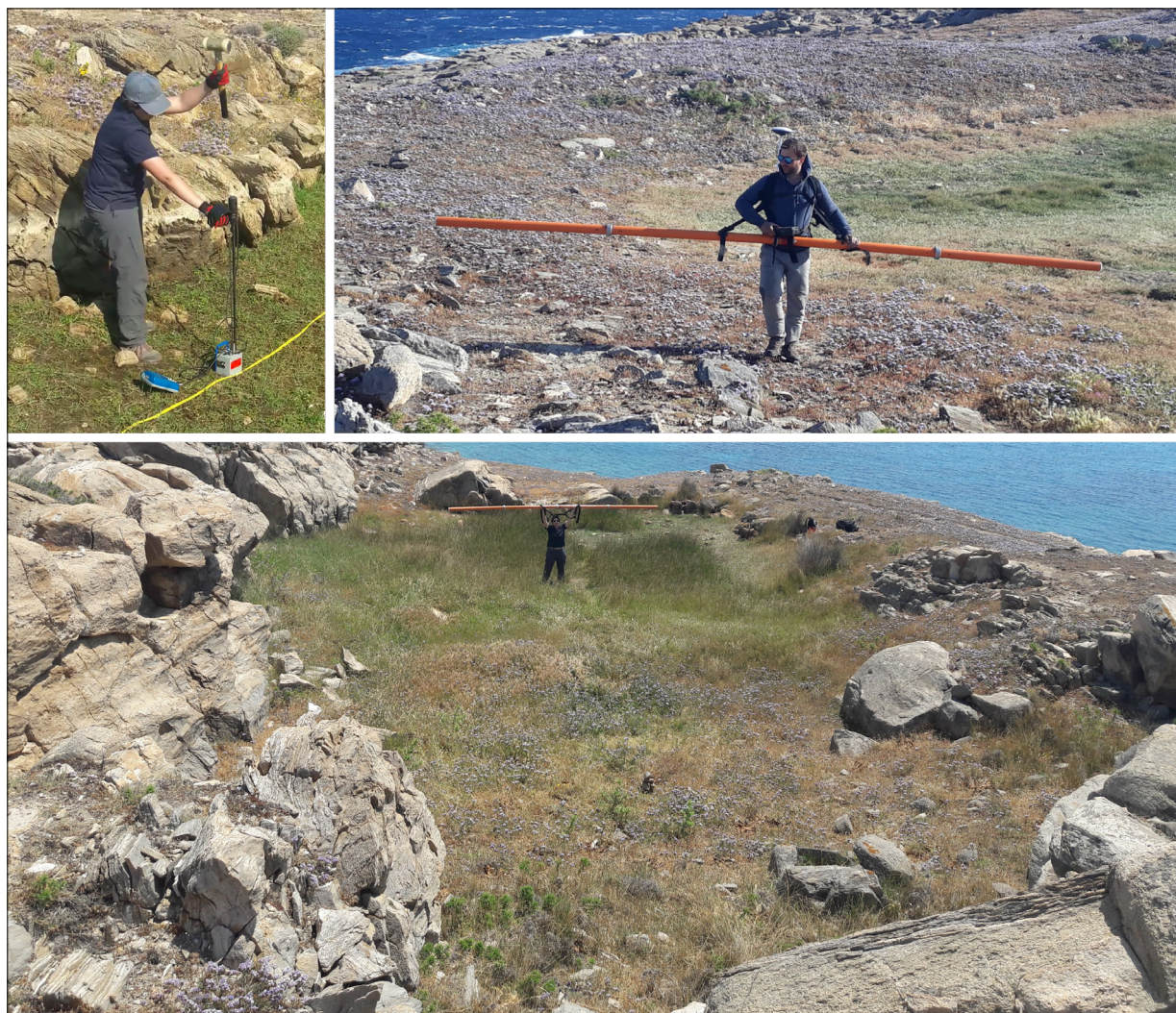
Fig. 1: Implementation of DCP sounding (top left), EMI mapping (top right) and example of quarry configuration (bottom) in Delos.

into the ground. The simultaneous measurement of the variable strike energy and the penetration depth of the rod after each blow allows us to calculate the ground resistance at the rod tip and to discriminate ground layers based on their mechanical properties. Due to the limited number of rod segments available, the maximum depth the DCP could reach was approximately 2.25 m. The rod can only pass through relatively soft media and would not penetrate the substratum. A stoppage is however not a definitive indication that the rod reached the bottom of the quarry as it could have encountered a block of rock. Nevertheless, these soundings give an important indication of the minimum thickness of the filling layer as the substratum cannot be above the penetration limit of the rod.