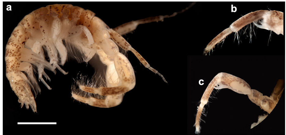
Figure 2. Chelicorophium curvispinum (G.O. Sars, 1895): male, profile (a), antennae 2 male (b), antennae 2 female (c). Scale bar: 2 mm.

the first antennae are short, attaining only 1/3 of the length of the total body. The first article of the peduncle is about the length of the other articles combined, and is armed below with 4–5 small spines. The second article has a similar spinule in the middle of the posterior edge. The flagellum is shorter than the peduncle and has less than 10 articles.