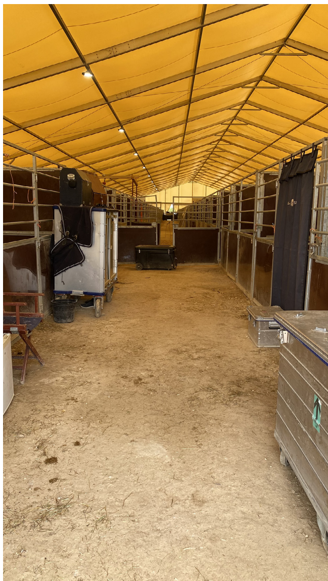
Fig. 3. Position of the boxes inside the tent. There was about 3.5m between two rows of boxes.

LABÉO PCR diagnosis was performed as described by Sutton et al [22]. Briefly, nucleic acids from nasal swabs were extracted using QIAamp Viral RNA Mini Kit extraction kits (Qiagen, Hilden, Germany) according to the manufacturer's recommendations. A Real-Time Polymerase Chain Reaction (PCR) was performed on purified nucleic acids for EHV-1 glycoprotein B (gB) gene detection using Diallo et al [23] primers and probe. TaqMan Universal PCR Master Mix (Thermo Fisher Scientific, Waltham, MA) was used for this PCR. Sensitivity of the PCR test is 108 copies/ \mu L of nucleic acid extract. Specificity is 100% after amplification of different EHV-1 (EHV-2, EHV-3, EHV-4, EHV-5, and EHV-9) and other respiratory viruses (EAV, EIV) and bacteria. A second real-time PCR was performed using Sutton et al [22] primers and probes for the ORF30 A/G/C2254 typing. TaqMan Universal Master Mix was also used for this PCR. Results were retrieved as qualitative, with presence or absence of detection. Multi Locus Sequence Typing (MLST) analysis was performed as described by Sutton et al [22].