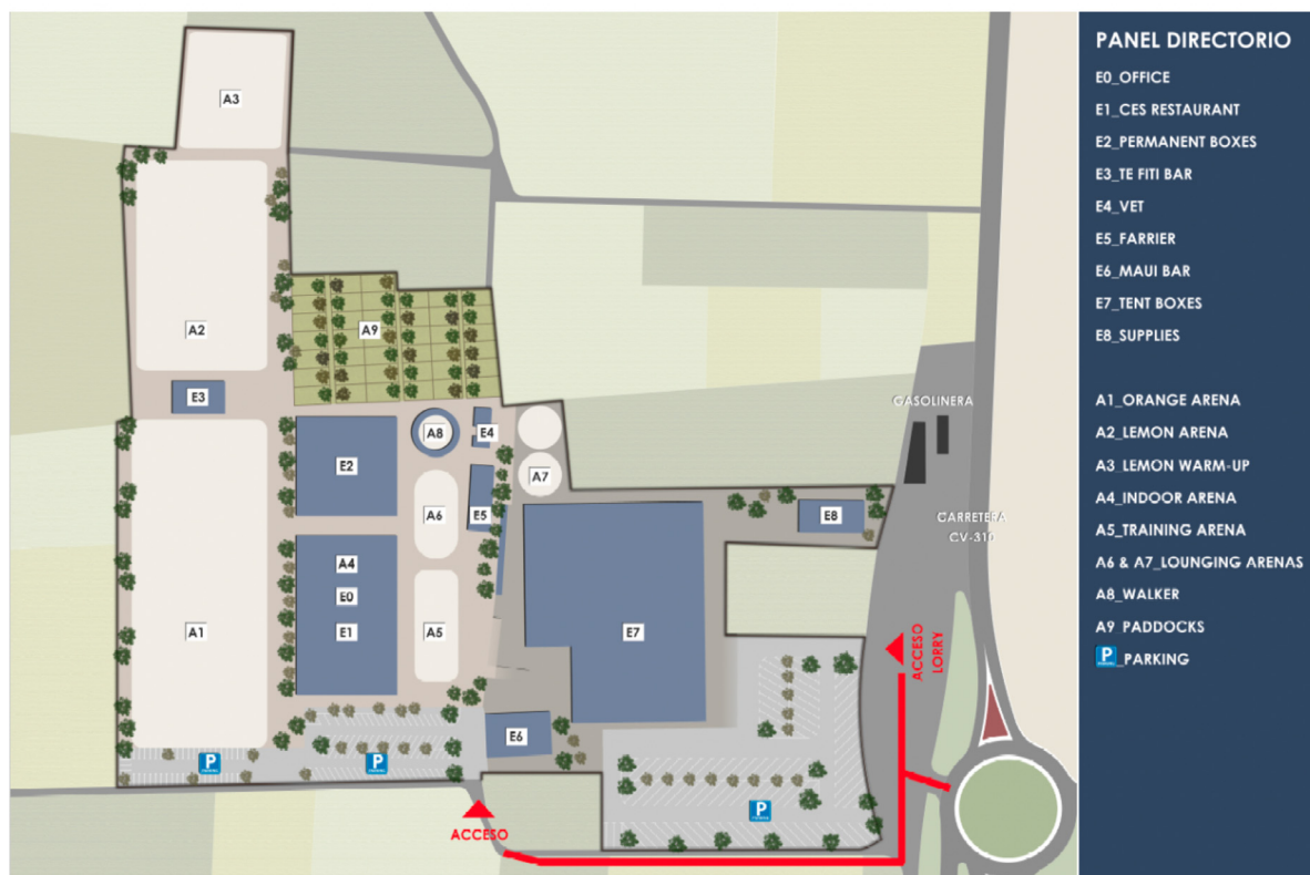
Fig. 2. Map of the site of CES Valencia Spring Tour 2021.