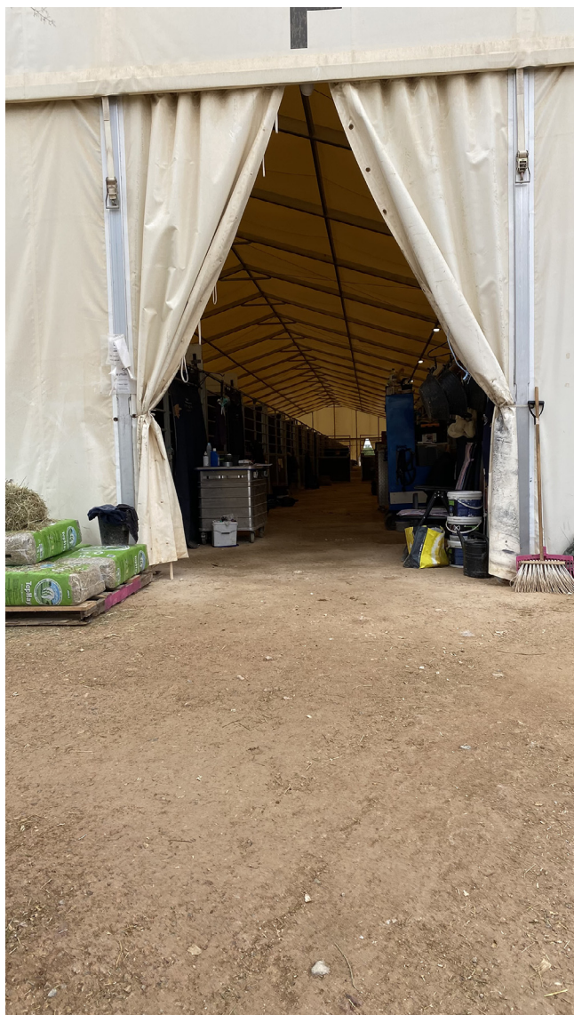
Fig. 5. Opening of the tent for ventilation.

vaxyn EHV 1,4 (ZOETIS), Pneumequine EHV1 (MERIAL), Prevaccinon EHV1 (INTERVET Deutschland), Bioequin H (IPVET). Vaccination began in 2011 for the older horses and in August 2020 for the youngest. Considering the on-site population of 160 horses, 43 (26.9%) were vaccinated, and 114 (71.2%) were not vaccinated with information not available for three horses (1.9%). There was a significant difference between our studied population (more horses vaccinated compared to nonvaccinated) and population on site (more horses nonvaccinated compared to vaccinated) ( P < .0001 ; Table 1).