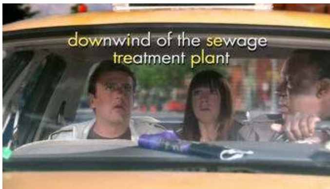
Figure 1. Lily and Marshall realise what “Dowisetrepla” stands for ( HIMYM 3x07 )

“Dowisetrepla” is obviously not understood by Lily and Marshall (even if Lily pretends that she does understand it) and only at the end of the episode do they and we understand what “Dowisetrepla” stands for, as shown in the following screenshot: