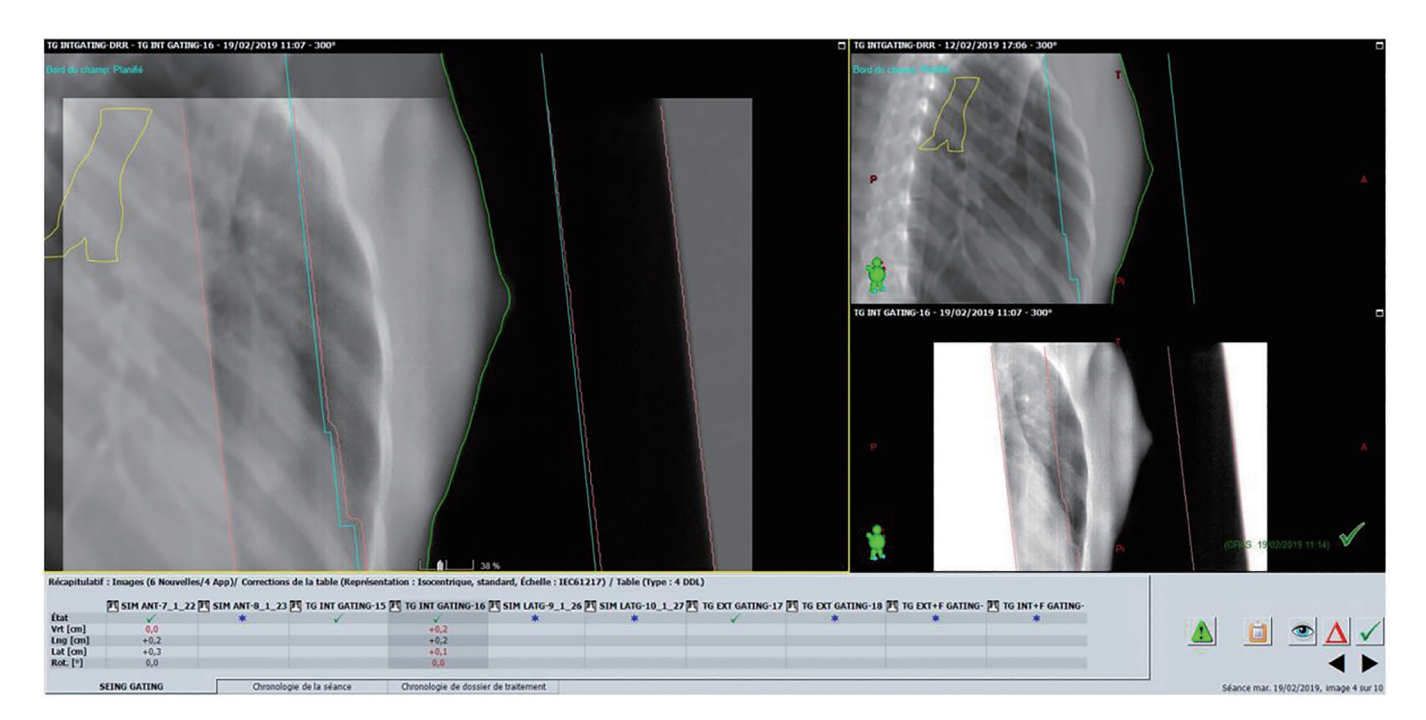
Figure 1 Screen capture of the repositioning imaging performed on a Clinac 2100<sup>®</sup>, by double exposure for a patient irradiated on the left breast. The left part of the screen shows the matching obtained between the daily imaging and the reference one (digitally reconstructed radiograms, DRR), the right window shows the DRR (top) and the daily image (bottom). In the lower strip of the window are displayed the corrections to apply and the status of medical approval.

oncologists regarding this part of their prescription in the realization of treatments. Thus, they are able to make any decision to alleviate, if deemed necessary, this over dosage. This information may be critical, in particular, for situations as for re-irradiation. It is also of interest in a perspective of development of risk models of radiation-induced secondary cancers. Actually, this exposure source, if neglected, would lead to overestimate the role of therapeutic irradiation itself in epidemiological analysis of this risk.