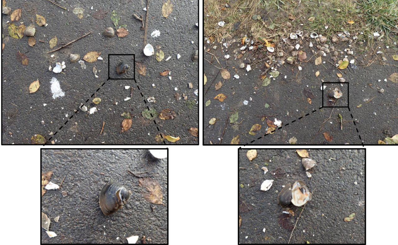
FIGURE 4 Individuals of Rangia cuneata broken by herring gulls from Ouistreham harbor