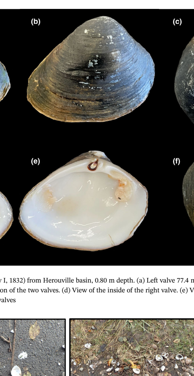
FIGURE 3 Rangia cuneata (G. B. Sowerby I, 1832) from Herouville basin, 0.80 m depth. (a) Left valve 77.4 mm long. (b) Right valve. (c) Same specimen, viewed from the dorsal region of the two valves. (d) View of the inside of the right valve. (e) View of the inside of the left valve. (f) View of the frontal region of the two valves