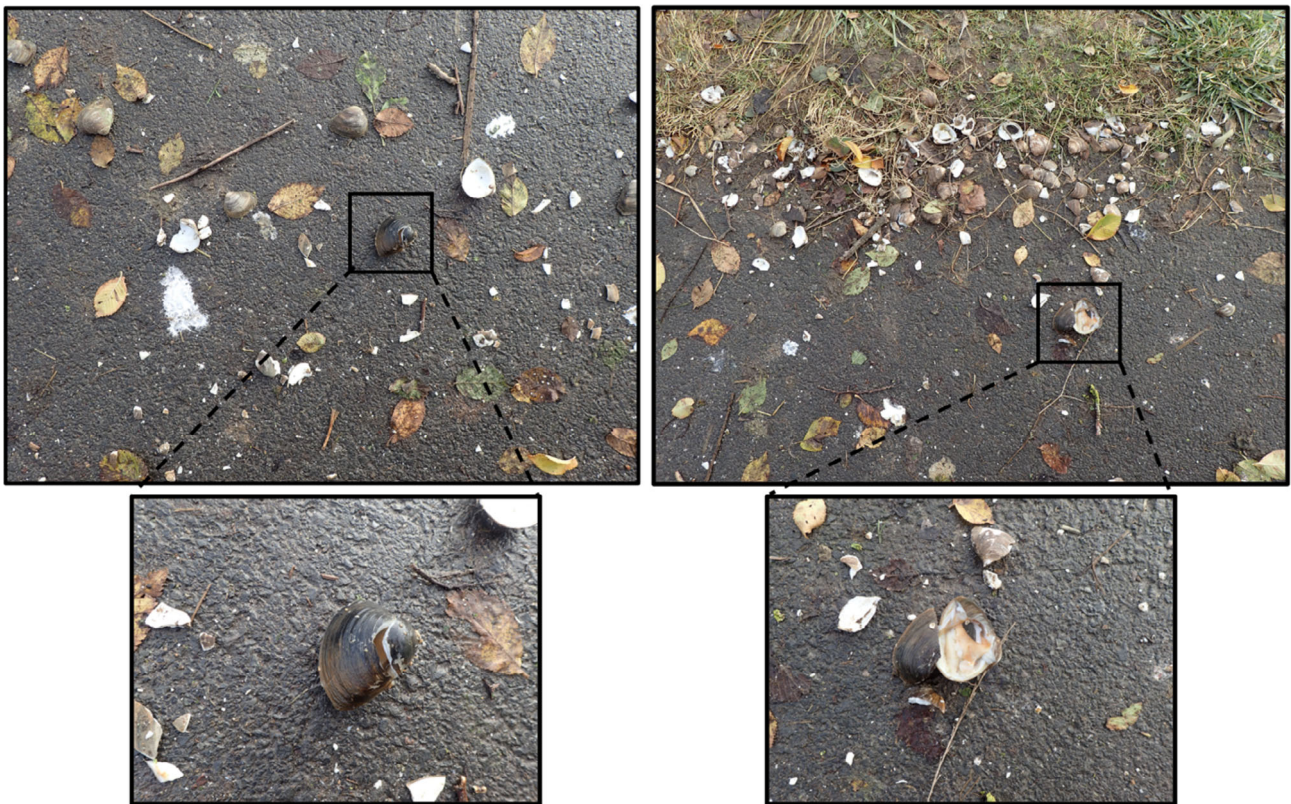
FIGURE 4 Individuals of Rangia cuneata broken by herring gulls from Ouistreham harbor