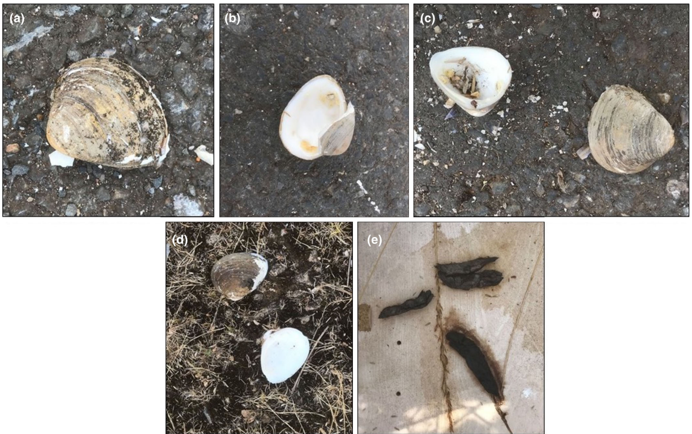
FIGURE 2 Individuals of Rangia cuneata from Ouistreham harbor (a, b, c) and individuals of R. cuneata from Herouville basin (d), and other excrements (e)