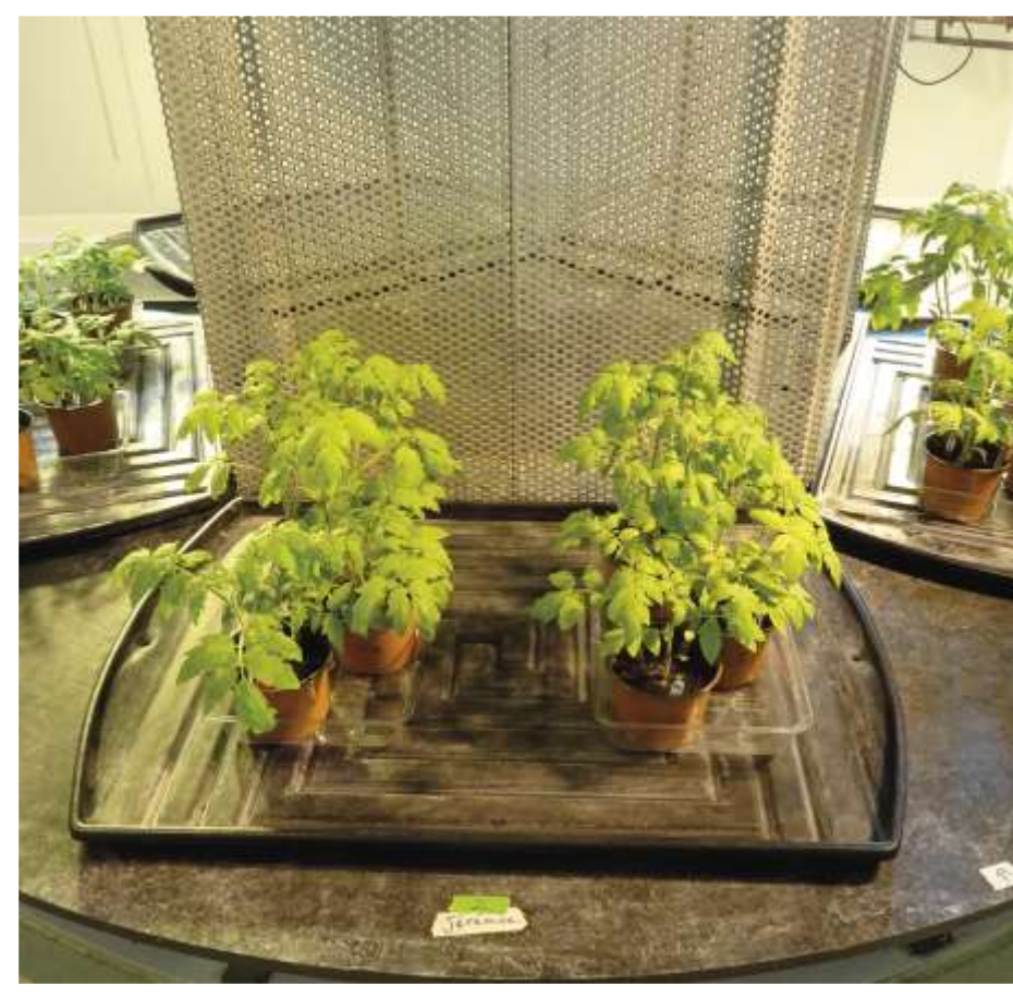
In plant pots