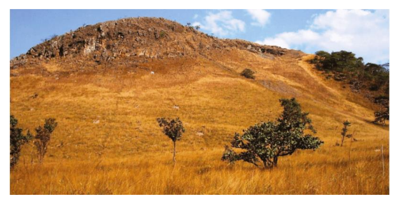
Figure 1. Photograph of a Cu and Co hill.

As I explained in my previous article on the environmental impact of the <u>increasing demand</u> <u>for cobalt (Co)</u>, mineral resources have been exploited in the Democratic Republic of Congo (DRC) for thousands of years. Such exploitation results in abandoned <u>metalliferous mine</u> <u>wastes</u> with high concentrations of metals. It also results in the contamination of surrounding ecosystems.