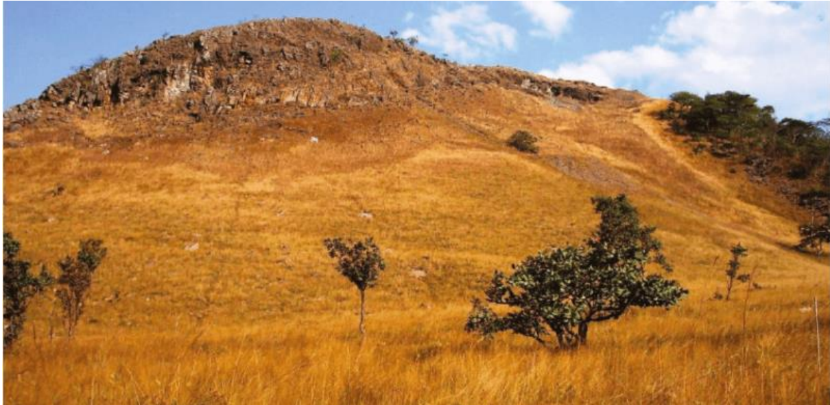
Figure 1. Photograph of a Cu and Co hill.

As I explained in my previous article on the environmental impact of the increasing demand for cobalt (Co) , mineral resources have been exploited in the Democratic Republic of Congo (DRC) for thousands of years. Such exploitation results in abandoned metalliferous mine wastes with high concentrations of metals. It also results in the contamination of surrounding ecosystems.