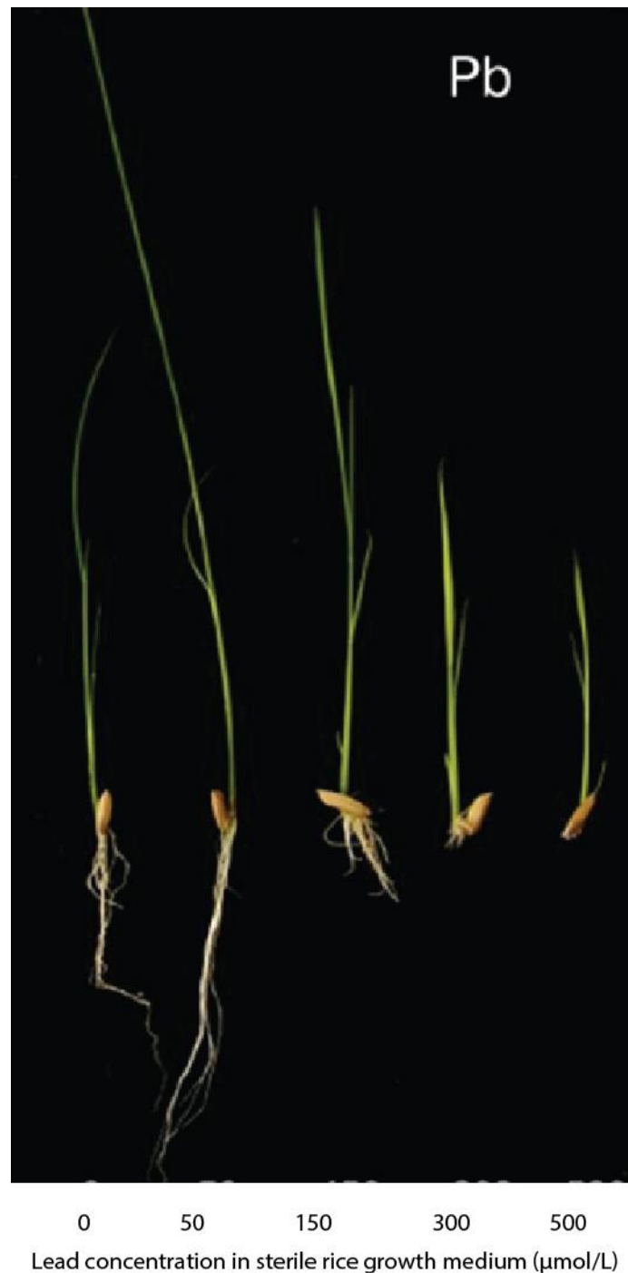
Figure 1. Effect of increasing Pb concentrations (from 0 to 500 \mu\text{mol/L} in growth medium) on the growth of the control rice variety (Marquez et al., 2018).

These findings are described in the article: