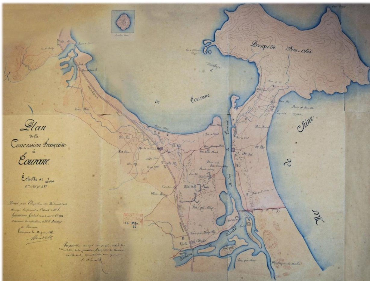
Fig. 3. Inspecteur des Bâtiments Civils, “Plan de la concession française de Tourane” (1/40 000), June 12, 1889. ANOM, GGI, F, 5990.