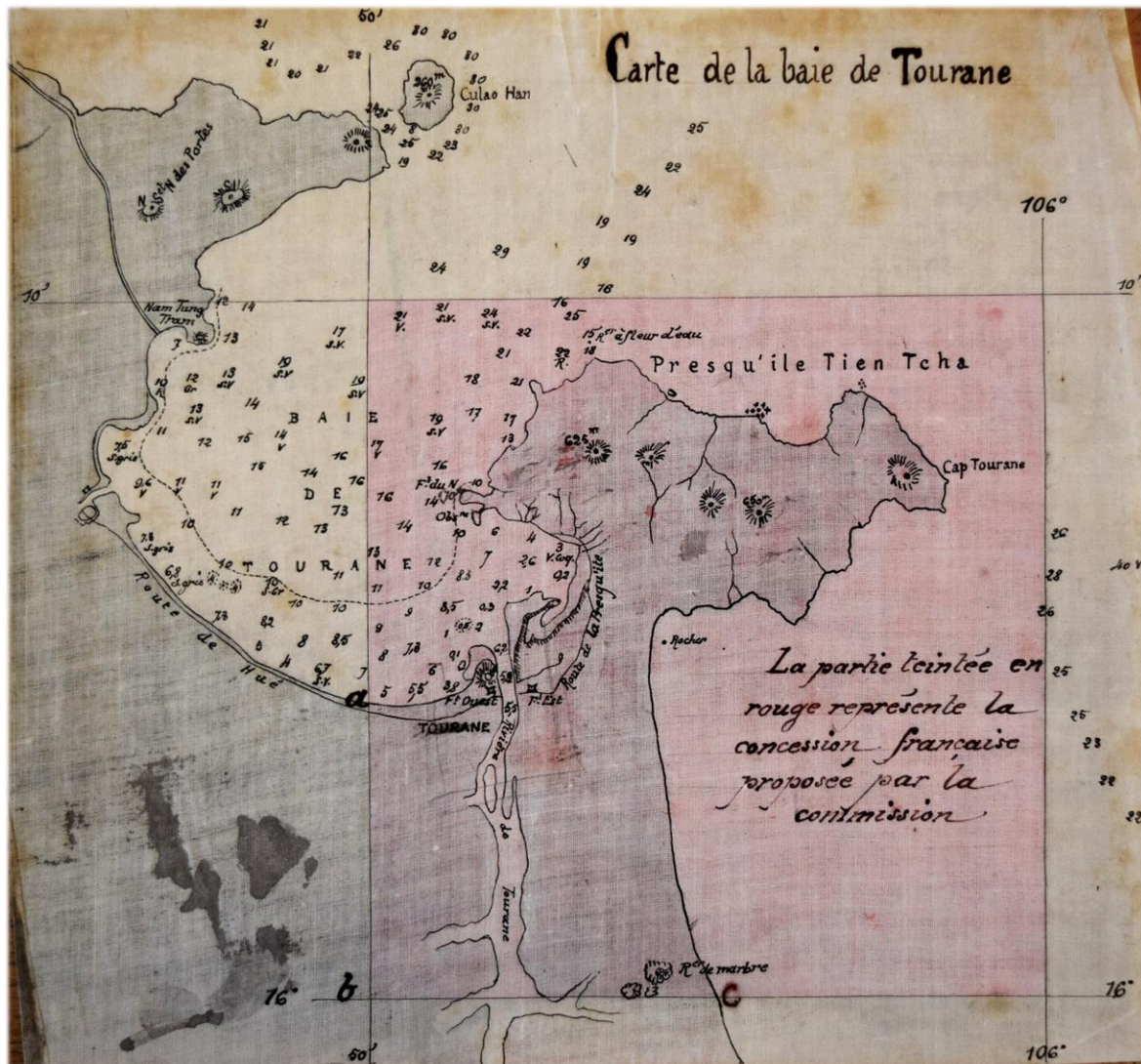
Fig. 1. Map of the French concession of Tourane drawn by the Navelle Commission, c. March 1885. ANOM, FM, SG (Indo), AF, 107, F 20 (2).

Responding to the will expressed by the Commission, Lemaire adopted a relatively ambiguous discourse: while he supported several of the conditions suggested for rooting French rule, he nevertheless was very critical about the proposed area for the concessions, particularly for Tourane, judging that they overstepped the framework of the regime instituted by the protectorate. He believed the role of France should be distributed over the entire kingdom and not concentrated on certain locations that would inevitably resemble, under such conditions, a territorial annexation. As for the expected commercial and industrial development, he asserted that it could only come about progressively. He proposed to the MNC to down scale the territorial aspirations advocated by the Commission, casting aside the proposal to include Tiên Sa peninsula, and expressing the wish that the southern and western limits be brought back to the limits of the dwellings at the mouth of the river. Answering the issue of extending the concession boundaries to accommodate future commercial, industrial and demographic growth, he put forward the possibility for those interested to buy land around the concession, when the need would arise. On this point, he took as a model the French concession in Shanghai [Ibid. Lemaire to MNC].