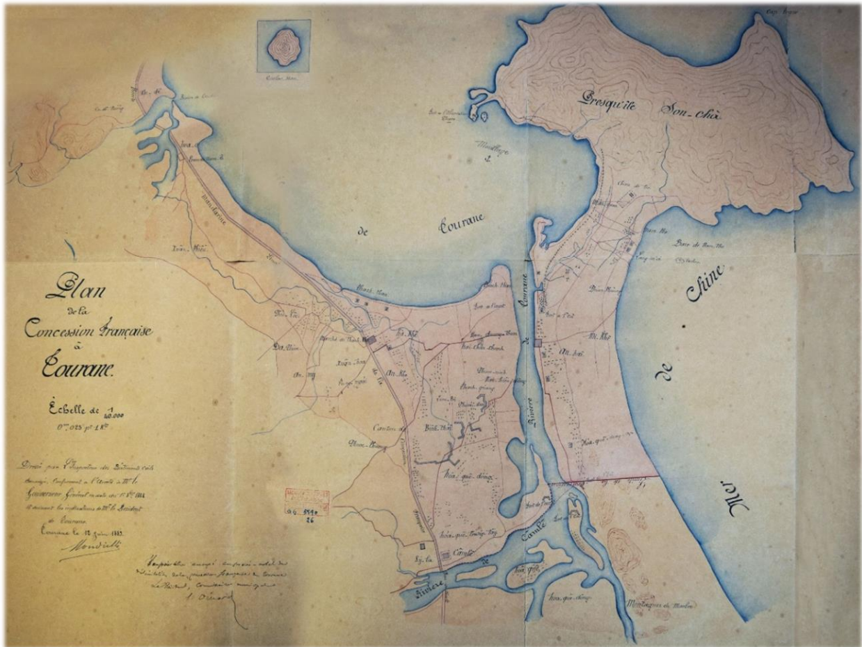
Fig. 3. Inspecteur des Bâtiments Civils, “Plan de la concession française de Tourane” (1/40 000), June 12, 1889. ANOM, GGI, F, 5990.