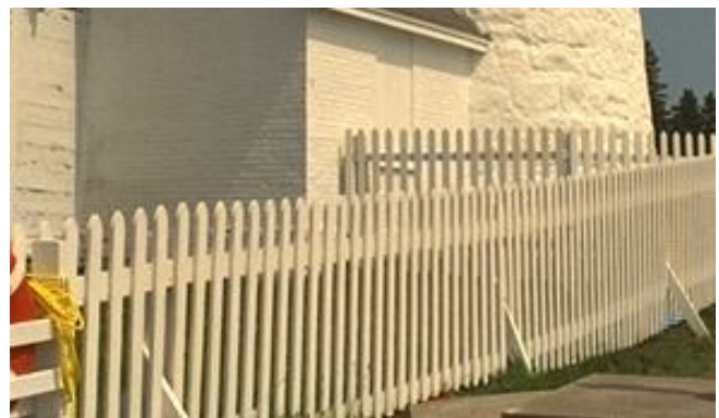
Figure 4. Close-up on the aliasing part of the reconstructed lighthouse image using second type order 4 Mallat's wavelet