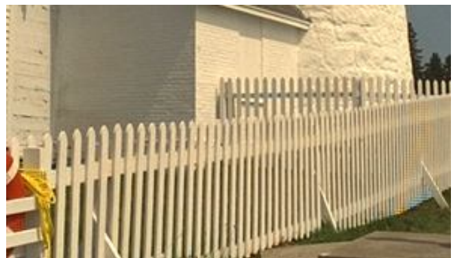
Figure 5. Close-up on the aliasing part of the reconstructed lighthouse image using second type order 3 Mallat's wavelet