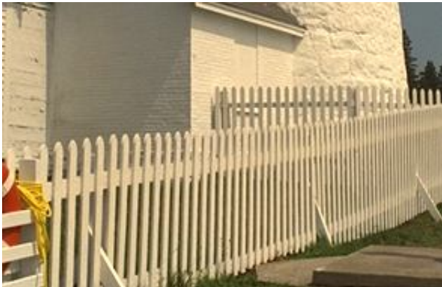
Figure 2. Close-up on the aliasing part of the original lighthouse image