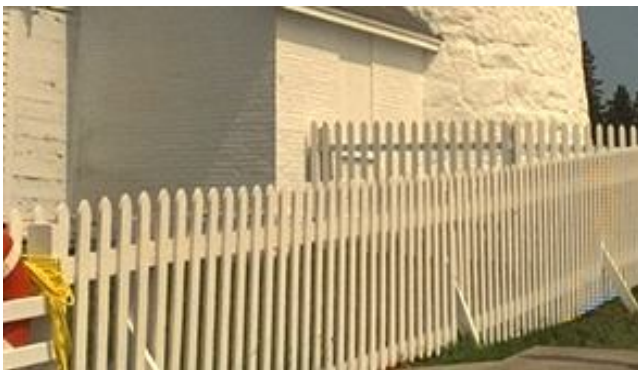
Figure 3. Close-up on the aliasing part of the reconstructed lighthouse image using first type order 3 Mallat's wavelet