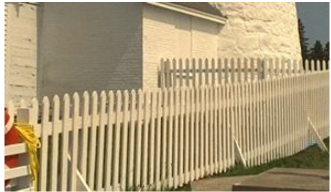
Figure 4. Close-up on the aliasing part of the reconstructed lighthouse image using first type order 4 Mallat's wavelet