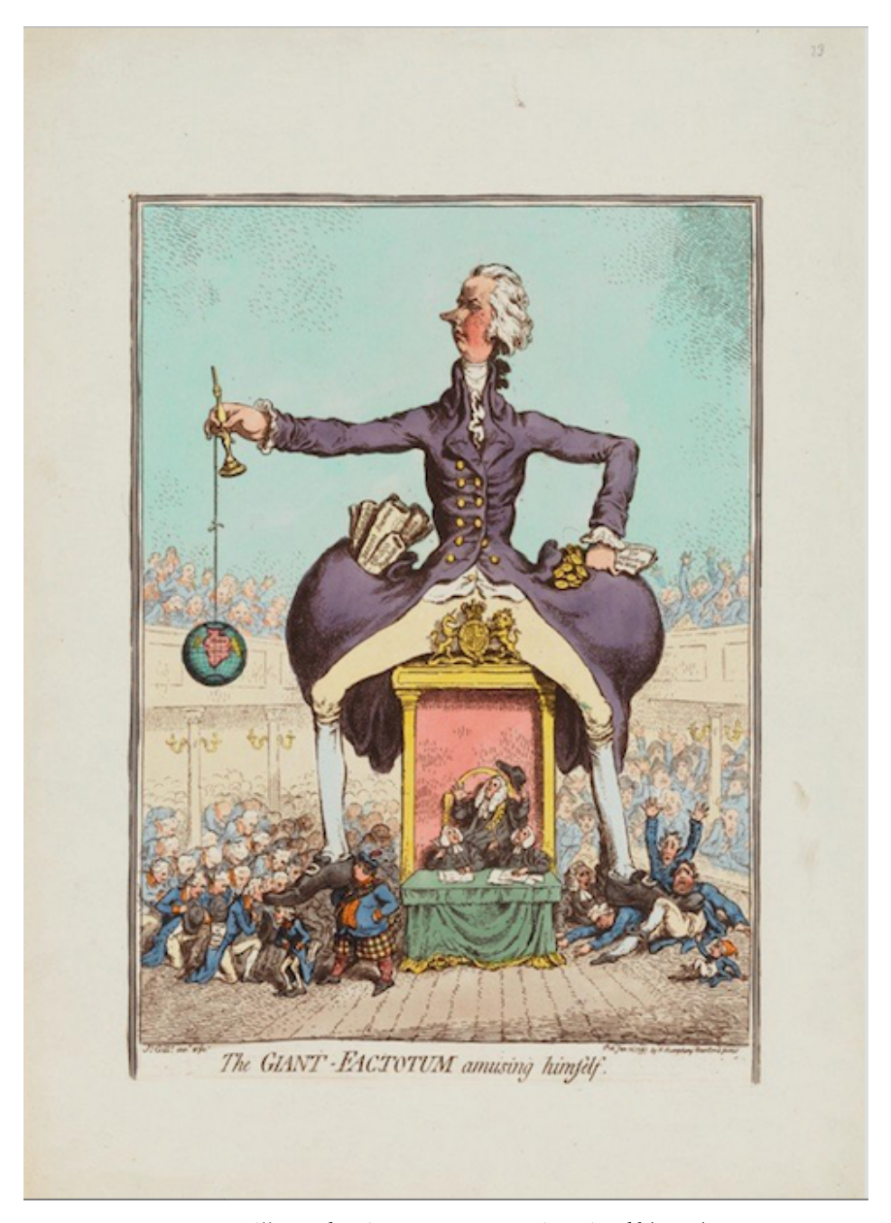
James Gillray, The Giant Factotum Amusing Himself (1797)

and indistinct crowd is represented, evocative of a proletarian wave about to submerge the British nation. Filtered through a range of artistic conventions like caricature and the grotesque, the Tomahawk 's working-class rising tide evokes "the well established traditions of repulsion and contempt through which eighteenth-century caricature described the labouring poor." <sup>10</sup>