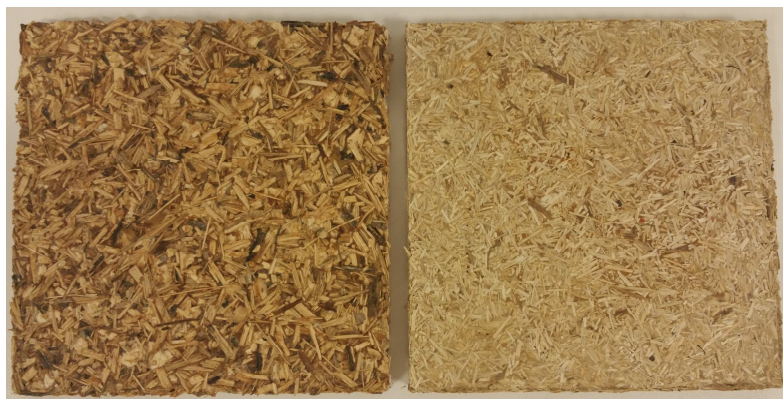
Fig. 2 : Particleboards made of big sunflower bark on the left and made of big flax shives on the right.

mold used is fully closed, thereby restricting evaporation. In an industrial production, larger presses with open edges are used, speeding up the water evaporation so reducing the hot-pressing time. In the literature some solutions are proposed to reduce the thermopressing time, such as drying the mixture of vegetal particles with aqueous adhesive solution in an oven (during 24h at 100°C) to remove a part of the water before the thermopressing [5]. Another solution, studied by Mati-Baouche et al., is to dry the boards in an oven (during 50h at 50°C) after a short compression of 1 min. In all cases more time is necessary to remove water from binderless boards or from boards made with an aqueous adhesive than to cross-link a synthetic resin. In the laboratory-scale mold, spacers are utilized to stop the closure of the mold in order to obtain a fixed panel volume (150 x 150 x 15 mm) and so the target density. The mat of vegetal particles with the binder of initially approximately 70 mm high (particles compacted by hand) was compressed until the final thickness of 15 mm. The pressure is applied on the spacers and not directly on the vegetal matter, so the pressure applied on the board is not known as soon as the spacers have been reached. Figure 2 shows the surface of the boards made of big flax particles and big sunflower ones bound with the casein-based adhesive.