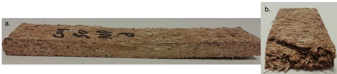
Fig. 3 : Photography of a flax board sample after the bending test: surface and cross section (a), fracture section (b)

shows a photography of a flax board sample for the bending test. On picture (a) we can see the surface and the cross section of the sample cut with a bandsaw while picture (b) shows the fracture section after the bending test. The picture on the Figure 3(a) corresponds to a board sample after the bending test. That is why this sample is warped. This distortion is the result of breakage by bending test. To observe the fracture section as shown on the Figure 3(b), a much longer displacement was applied on the sample after the first breakage. The tests were repeated five times, at ambient temperature. The three-point bending test allows determining the modulus of rupture (MOR) and the modulus of elasticity (MOE).