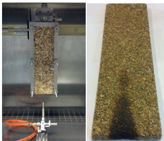
Fig. 4 : installation for test of resistance to fire and example of some boards after the test

The resistance to fire of the particleboards made of flax shives and sunflower bark was tested according to EN ISO 11925-2 [24]. The measurements were realized in a dedicated chamber where samples of 90*290*15mm 3 were exposed to a propane flame inclined by 45° on the lower edge of the sample during 30 s. Measurements were realized in triplicate on each board. After exposure to the flame, the absence of ignition and of flaming droplets was observed and the height of the damaged zone was measured. Figure 4 shows the installation to realize this measurement and an example of the damage zone after the test on a sunflower board.