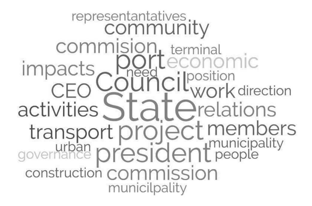
Figure 4. The cloud of words most used by the urban-port stakeholders of Klaipėda

An analysis of the different stakeholders' pronouncements confirms the weight of state leadership (Figure 4). In effect, the interviews were embedded in two text analysis software packages (NVIVO and ALCESTE), in order to build a tag cloud of the words most used in the interviews, to identify those that referred to port-city links in the framework of extended territory, or to create a network of forms around three key words, city, port and governance, with a view to identifying the words most linked to those in the talks.