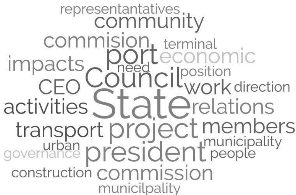
Figure 4. The cloud of words most used by the urban-port stakeholders of Klaipėda

An analysis of the different stakeholders’ pronouncements confirms the weight of state leadership (Figure 4). In effect, the interviews were embedded in two text analysis software packages (NVIVO and ALCESTE), in order to build a tag cloud of the words most used in the interviews, to identify those that referred to port-city links in the framework of extended territory, or to create a network of forms around three key words, city, port and governance, with a view to identifying the words most linked to those in the talks.