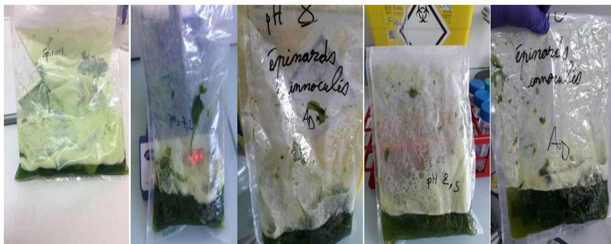
Fig. 1. Effect of glycine buffer pH on foam formation with spinach leaves during the elution process.