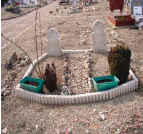
Figure 5: Very modest, family-made grave in the Muslim cemetery of Bobigny.

testified to the surprisingly great liberty the Muslim community enjoyed in running the cemetery as well as the liberal nature of interpretation of Muslim funeral norms (El Alaoui 2012).