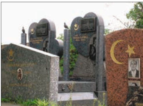
Figure 6: Funeral Steles from the 1980s. The magnificence of the funerary architecture and the presence of photographs of the buried are contradictory to the Muslim norm

At the level of the tomb, a great diversity of funeral architecture styles reigns at the Bobigny cemetery. From the austerity to