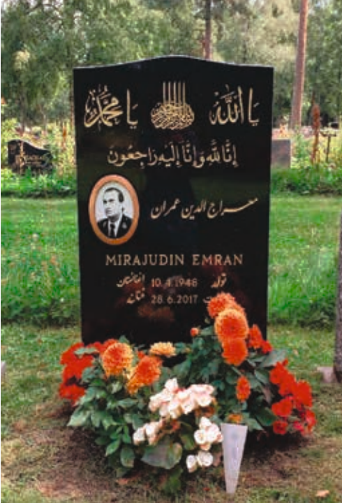
Figure 16: A recent tomb of a Muslim individual buried at the Islamic section of the Lamminpää Lutheran cemetery in Tampere.

the insufficiency of burial grounds, and the Lutheran church run sections try to accommodate for particular norms such as orientation towards Mecca, quick burial and diversity of funeral monuments. In other words, it seems as if the public authorities now attempt to make room for the Muslim minority in the national community of the dead, at least in the larger cities. However, they also define in the conditions of belonging in the national community of the dead and the living that the minorities should not trespass, unless they are ready to run the risk of appearing as a threat to the cohesion of the Finnish nation-state.