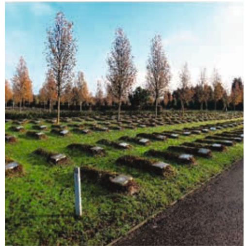
Figure 13: The 21 st Muslim Private Cemetery Garden of Peace

The cemetery’s landscape is in sharp contrast with that of Muslim graves in Brookwood Cemetery. None the less, both can be considered as the by-products of multicultural management of