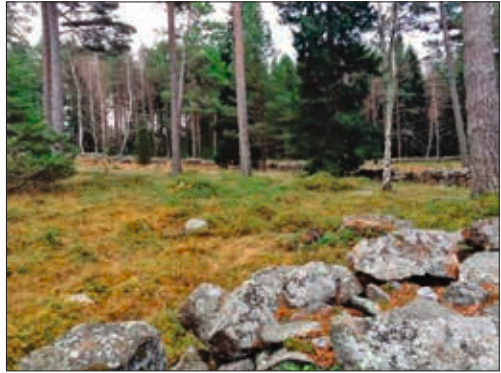
Figure 1: The Islamic section of the Prästö military cemetery

The cemetery is an interesting entry to the analysis of the historical formation of the Muslim minority's membership in Finnish society. First of all, it allows for critically examining myths of Finns as an unusually ethnically homogeneous group and of population diversity as a historical novelty (Tervonen 2014). The case indeed draws attention to the de facto ethnic and religious plurality of 19 th century Finland and to the anomalous nature of the period between Finland's independence and internationalisation (1917–1990), characterised by historically