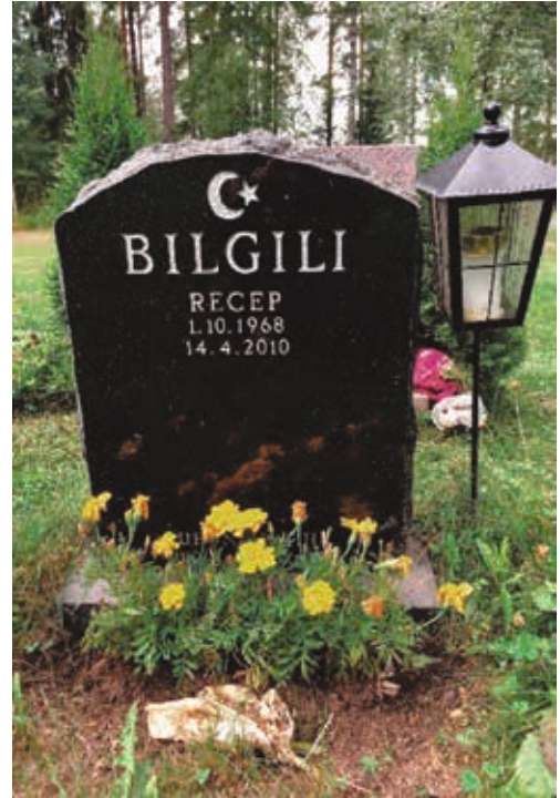
Figure 15: A recent tomb of a Muslim individual buried at the Islamic section of the Lamminpää Lutheran cemetery in Tampere.

The current solution to Muslim burial can be thought to reflect a particular logic of governing diversity that is typical of Nordic countries, namely the logic of “institutional absorption of difference” (Borevi 2012). The Finnish variant of multiculturalism differs from the British version in that it is more timid in favouring legal exceptions granted to minorities, such as burying in shrouds only, and in setting up of minority confessional cemeteries. The Finnish case also differs from the French context’s strong secular and assimilationist impetus in that within a given public institution, here the cemetery, room is made for minorities’ customs. Muslims do not suffer from