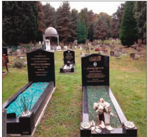
Figure 9: Diversity of architectural styles in the Muslim section of Brookwood cemetery

common Muslim identities in a variety of ways; through the performance of rituals after their death; through the choice of signs, symbols and markers; and through