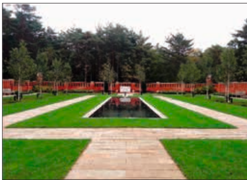
Figure 2: Woking Garden of Remembrance, Peace Garden

cemetery in 1915; wounded Muslim soldiers were treated for their injuries at the Indian Army Hospital set up in Brighton's Royal Pavilion (Tibawi.al 1981: 195). Contacts were established between the hospital's officers and the Imam of the Woking Mosque, which was the only and first purpose-built mosque at the time to ensure that deceased Muslim soldiers were given the appropriate religious Muslim burial. A decision was made to purchase land near the mosque for a burial ground, and the religious funerary rituals were performed at the nearby Woking Mosque (Islamic Review: 5532). It is located on the southeast corner of Horsell Common, near the Shah Jahan Mosque in Woking. It was originally known as the Woking Muslim Military Cemetery. 17 soldiers from WWI were buried there and 8 from WWII. In 1969, the Commonwealth War Grave Commission made the decision to exhume the bodies and reinter them in the Brookwood Military Cemetery. Since then, the site has slowly fallen into neglect.