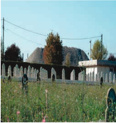
Figure 17: In the Muslim cemetery. In the background right, the new entrance welcome building. The military plot presents the official Muslim steles.

desire to advance immigrants' and their descendants' integration into French society, even when that meant largely assimilationist measures, such as the 2004 law that prohibited the wearing of external signs of religions in school.