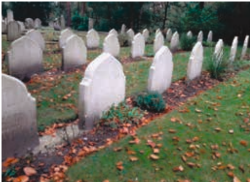
Figure 7: The Muslim military ground at the Brookwood Cemetery

in 1889 by G. W. Leitner, head of the Oriental Institute. The Oriental Institute soon closed, but the plot remained for the exclusive use of “Muhammadans” since June 1914 (Clarke 2004: 236). The landscape of death in both the Woking and Brookwood cemeteries is shaped by the discourse of the living, as both cemeteries reflect the changing patterns of the politics of diversity but also a shift of paradigm of what is important in a given society at a given time. Drawing on Katherine Verdery, “I think of such spatio-temporal landmarks as aspects of people’s meaningful worlds”, they are testimonies of the shifting memories in relation to the discourse on identity (Verdery 1999: 39).