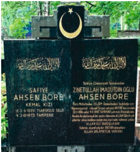
Figure 11: Tombstones at the Helsinki Islamic Cemetery

Today, the Tatars are considered an “old” minority, whose cultural, religious and linguistic particularities are thought to reflect the historical pluralism of the Finnish nation-state and a certain tradition of granting particular rights to minorities – the funeral heritage being intelligible against this particular logic of governing diversity.