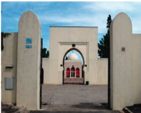
Figure 4: Entrance gate of the Muslim cemetery in Bobigny.

The cemetery remains, to this day, the only Muslim cemetery in metropolitan France. While a large migrant population, with a substantial Muslim constituency, settled in the territory by the 1970's, the 1881 law was called into question in 1975 by the Home Office Minister Pasqua. From a legal perspective, there was no obstacle to the creation of Muslim sections within French public cemeteries. Legislation concerning the carrés confessionnels (confessional sections) was scarce and boiled down to three Circulaires (bulletins) from the Home Secretary: that of 28 November, 1975, 14 February, 1991 and more recently 19 February, 2008. These