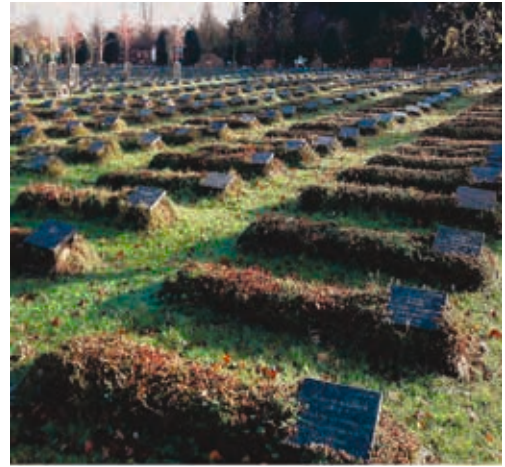
Figure 12: The 21 st Muslim Private Cemetery Garden of Peace

reference to possible countries of origin. Furthermore, all grave inscriptions are in the English language.