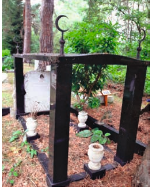
Figure 8: Diversity of architectural styles in the Muslim section of Brookwood cemetery

The Muslim plot is organised in sections according to the various Muslim faiths: Sunni, Ithna Ashari, Ismaili and Bohra Shias and Ahmadiyya. Furthermore, there is a variety of architectural styles within the Muslim section reflecting the diversity of national and social origins of the deceased. Today, Brookwood cemetery offers an ethnically and religiously pluralistic character, and to quote Ansari, the Brookwood environment “allowed for the collectivising and anchoring their