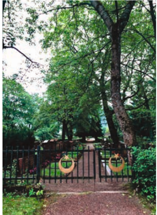
Figure 10: The entrance gate of the Helsinki Islamic Cemetery

Finland also differs from Britain and France in terms of its tradition of management of burial grounds by confessional bodies. No private for-profit cemeteries exist up to today like in the British context. One does not find entirely publicly run