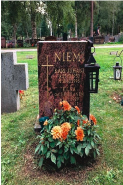
Figure 14: Standard Lutheran funeral monument at the Lamminpää Lutheran cemetery in Tampere.

As it stands, Muslims in Finland are typically buried at the Islamic sections of Lutheran cemeteries, sometimes in the non-confessional sections, and even more rarely at the Free Thinkers' non-confessional cemeteries. The ritual wash, ghusul , is always performed at the hospital and burying in shrouds only, kafan , is prohibited by burial law in the entire country. The Islamic section of Lutheran cemeteries is almost always organized so that the body may face Mecca and in large cities at least one grave is permanently open in order to guarantee a quick burial – the deceased typically spending several weeks at the morgue in Finland.