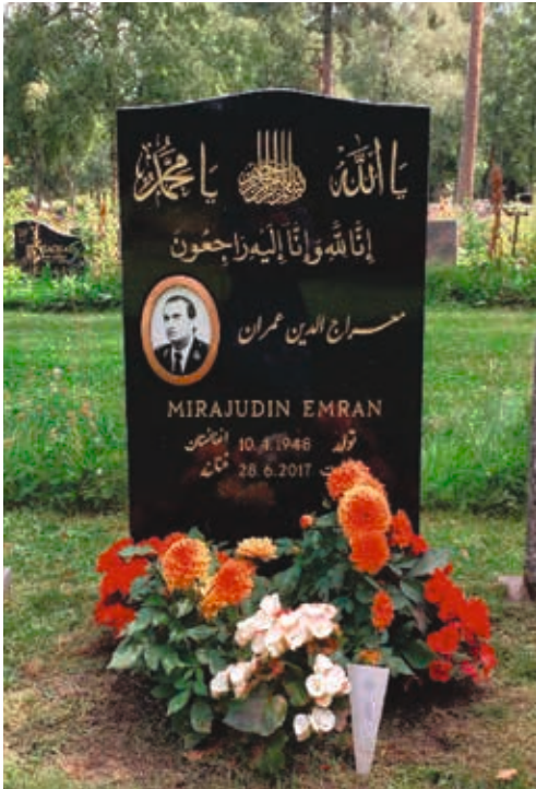
Figure 16: A recent tomb of a Muslim individual buried at the Islamic section of the Lamminpää Lutheran cemetery in Tampere.

the insufficiency of burial grounds, and the Lutheran church run sections try to accommodate for particular norms such as orientation towards Mecca, quick burial and diversity of funeral monuments. In other words, it seems as if the public authorities now attempt to make room for the Muslim minority in the national community of the dead, at least in the larger cities. However, they also define in the conditions of belonging in the national community of the dead and the living that the minorities should not trespass, unless they are ready to run the risk of appearing as a threat to the cohesion of the Finnish nation-state.