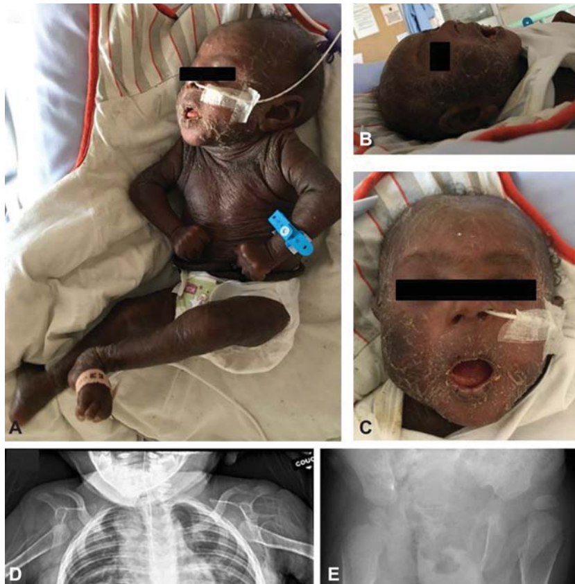
Fig. 1 Clinical presentations: photographs aged 11 months (A, B, C) and X-rays (D: chest X-rays and E: pelvis X-rays). Observe the dysmorphia with triangular face, low and posteriorly rotated ears, anteverted nares, and small mouth with thin vermilion lips. Skin is wrinkled, abundant, and dry with cracks on the face. Note four limb contractures with dislocated shoulders and hips, also present on X-rays.