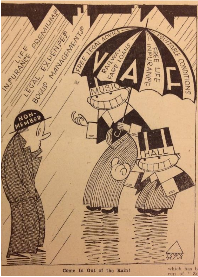
Come In Out of the Rain!