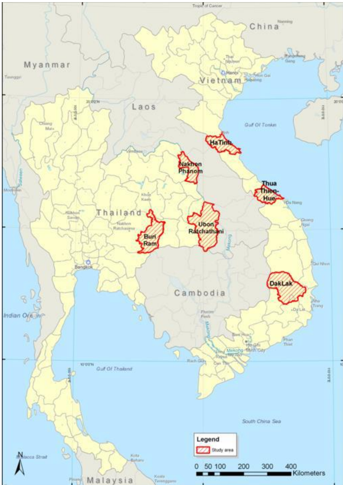
Figure A1: Area of survey.