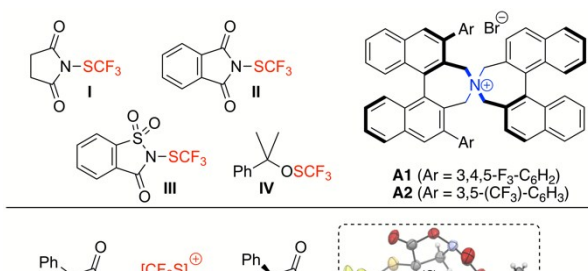
Table 1. Identification of the best-suited SCF3-transfer reagent, catalyst and conditions for the synthesis of 2a.a