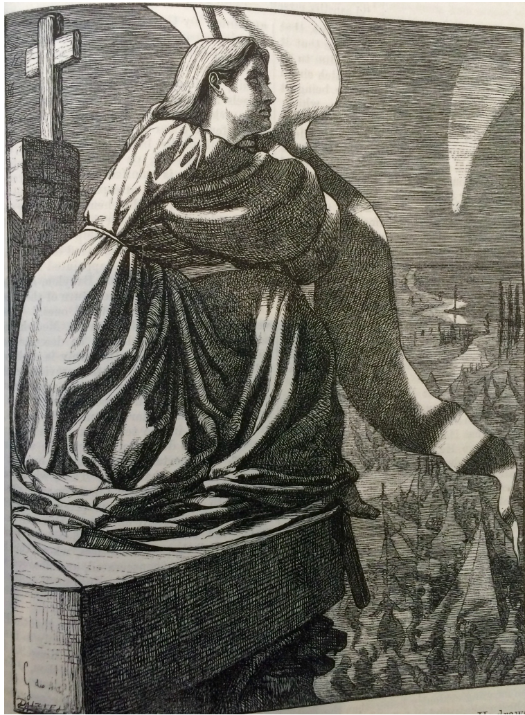
Fig. 4. 'A Time to Dance', 1861, George du Maurier.