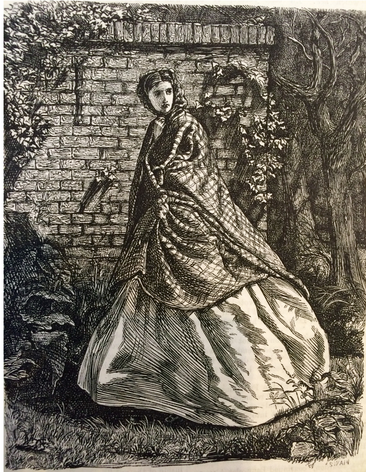
Fig. 6. ‘Eleanor’s Victory’, 1863, George du Maurier. Wood-engraving ( Once a Week 9).

‘Working to the editor’s agenda,’ Cooke remarks, ‘the artists of Once a Week convert the magazine into a Pre-Raphaelite journal, essentially a much more effective realisation of the Pre-Raphaelites’ ideals than their own periodical, The Germ ’. 15