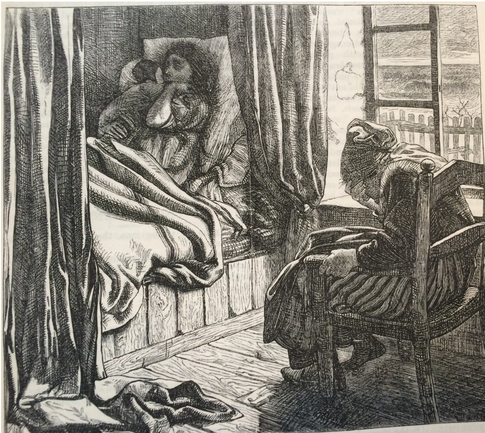
Fig. 3. ‘On her Death-Bed’, 1861, George du Maurier.