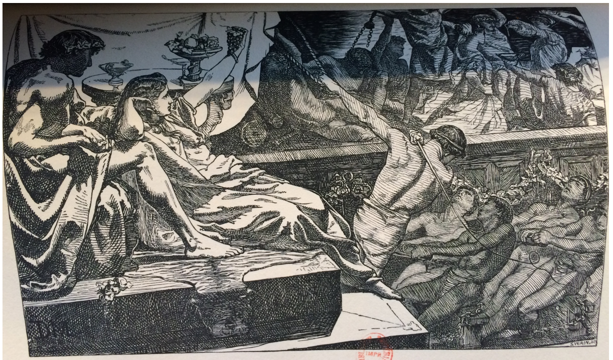
Fig. 5. ‘The Cilician Pirates’, 1863, George du Maurier.

In the case of du Maurier, the argument is convincing. In his letters to his family and friends, the young artist laments the difficulty of knocking at the doors of editors in search of work. His need for a regular income certainly made him more open to what was demanded of him by the various magazines. ‘I am very anxious to be kept on Once a Week as it is the swellest thing out, and gets one known,’ he writes to his mother in 1861, ‘and the more carefully I draw the better it will be for me in the end [...]’. 11