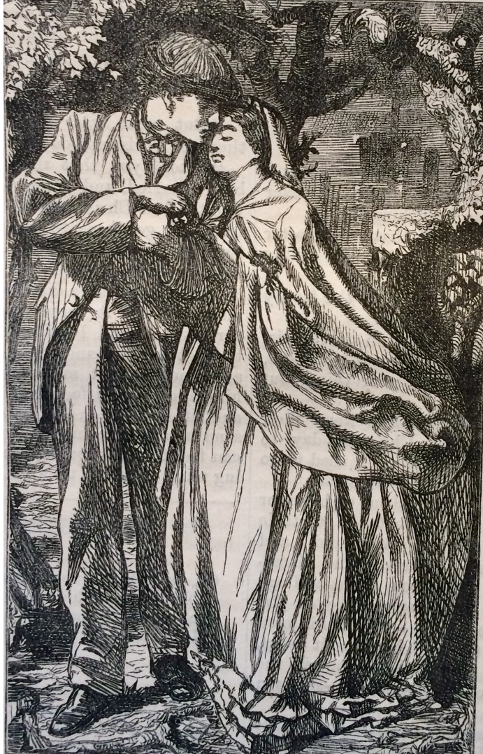
Fig. 2. 'The Hotel Garden', 1861, George du Maurier.