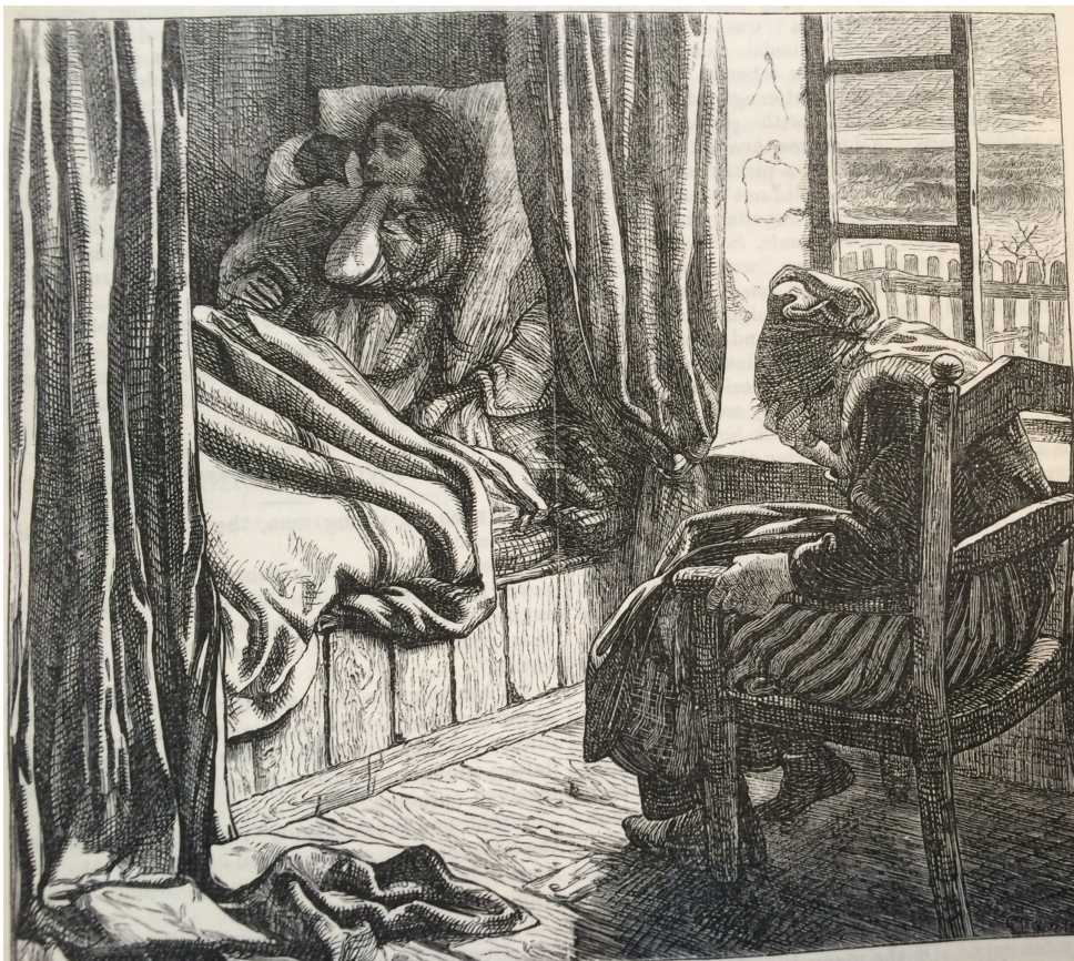
Fig. 3. ‘On her Death-Bed’, 1861, George du Maurier.

In May 1861, Once a Week published a poem by Arthur J. Munby entitled ‘On her Death-Bed. A Lullaby’. Composed of four rhyming quatrains, Munby’s ballad tells of a mother’s grief at the loss of her child and her hope of being reunited with him in the afterlife. Du Maurier’s illustration to this piece, one of his best drawings of the early 1860s, suggests a dramatic treatment of the subject.