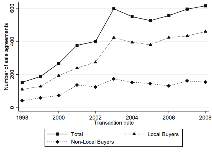
Figure 1: Annual number of sale agreements

The increase in the annual number of sale agreements also testifies to an increasing demand related to demographic and tourism pressure: as an illustration, Figure 1 depicts the rise in the number of sale agreements per year. These agreements quadrupled in 11 years, from 155 agreements in 1998 to 616 in 2008.