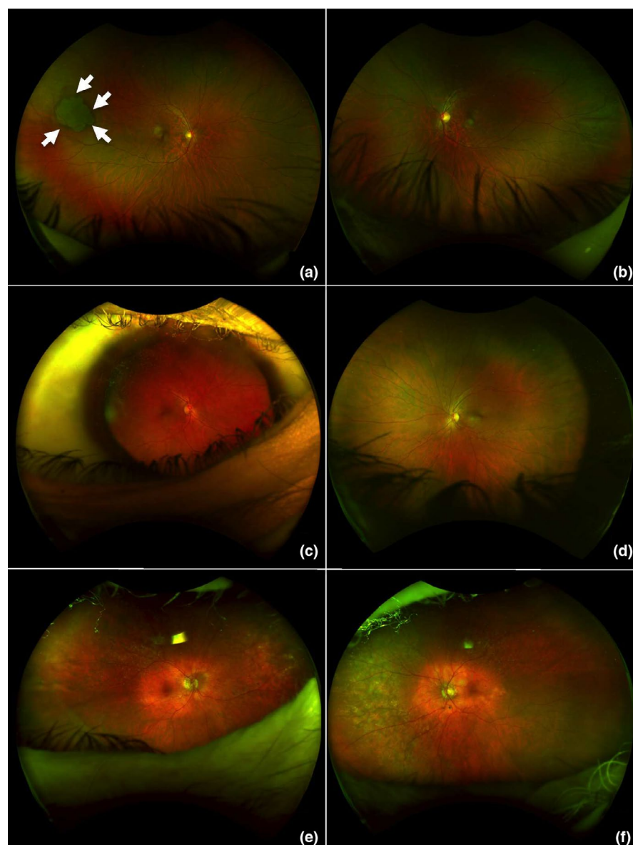
FIGURE 2 Ultra-widefield retinal imaging (200° with single capture acquired with Optos device) of the proband (IV.1 [in Figure 1], a and b), his mother (III.2, c and d) and his maternal grandfather (II.2, e and f), all carrying the mutation in RBI [NM_000321.2: c.45_76dup, p.(Pro26Leufs*50)]. (a and b) Ophthalmologic examination of the proband at age 18, in whom osteosarcoma developed at age 17: no history of leukocoria or strabismus. Visual acuity was 20/20 in both eyes. There was no retinoblastoma or retinoma. A single round flat lesion appeared on the far superior and temporal peripheral retina in the right eye (a, white arrows). This depigmented lesion is well demarcated with a ring or “halo” around its margin and agrees with a benign tumor of the retinal pigment epithelium (i.e., solitary congenital hypertrophy of the retinal pigment epithelium [CHRPE]). (c–f) No malignancy developed in the 47-year-old mother (c and d) or the 80-year-old grandfather (e and f) of the proband. Ultra-widefield photographs did not reveal any active or spontaneously regressed retinoblastoma

A literature review retrieved four cases of primary malignancy without prior Rb (sarcoma and nonsarcoma cancers but no osteosarcoma) in families with RBI low-penetrance hereditary mutations. Sarcoma was diagnosed in a female carrier of a pathogenic RBI splice variant (c.2520+6T>C) at age 64 (Dommering et al., 2014), leiomyosarcoma in a male carrier of the missense variant p.(Arg661Trp) at age 44 (Dommering et al., 2014); melanoma with no personal history of Rb in a male carrier of a deletion of exon 4 of RBI (Dryja, Rapaport, McGee, Nork, & Schwartz, 1993); and leiomyosarcoma in a 69-year-old female carrying a missense p.(His483Tyr) variant, showing sebaceous cell carcinoma of the eyelid 3 years later (Serrano et al., 2011).