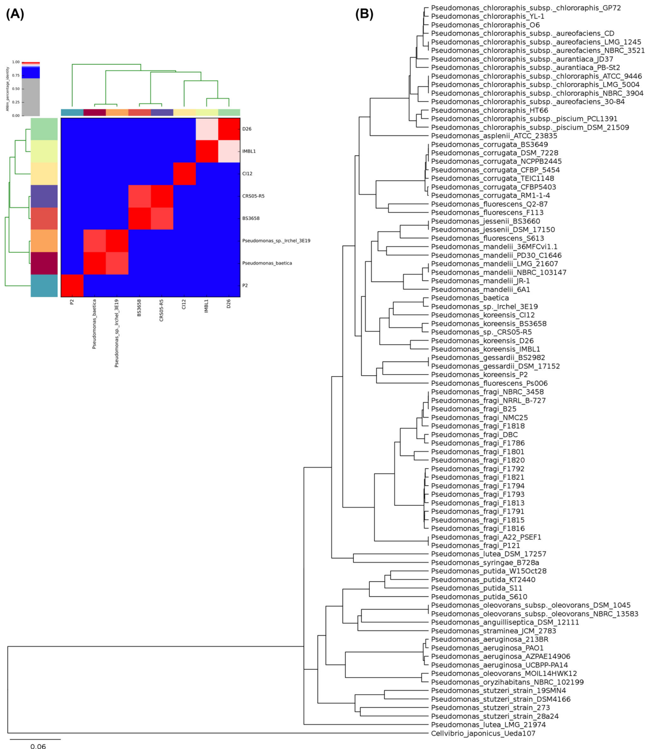
Figure 1. Placement of novel baetica genome in the genus Pseudomonas based upon ANI, and shared k-mers A) ANI heatmap generated the Python3 module pyani. The sequenced baetica genome, Pseudomonas .sp.Irchel_3E19 and reference genomes from the closely related koreensis subclade were subject to ANI analysis. B) A Mash-based tree generated from reference genomes ( n = 86 ) from 19 species clades, comprising the entire genus Pseudomonas . This tree was generated based upon the Jaccard index, calculated from shared k-mers. Cellvibrio japonicum Ueda107 was used as outgroup.