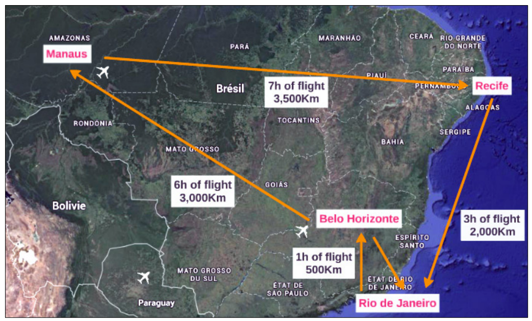
Figure 1. Schema of the 2014 Fieldwork during the WC in Brazil

Oualitative interviews are particularly useful as a research tool to understand individual's attitudes and values, things that cannot be necessarily be observed or included in a formal questionnaire. Open-ended and flexible questions are likely to get a more considered response than closed questions. Therefore, they provide better access to an interviewees' views, interpretations of events. understandings, experiences and opinions. In this research, semi-structured interviews were conducted with key actors from Brazilian football, divided into four groups: journalists specialized in Brazilian football, presidents of football clubs based in the four host cities considered, fans, and managers directly responsible for stadiums. A total of 57 interviews were conducted with 26 individuals between 2013 and 2015. Information concerning interviews are presented in the table below.