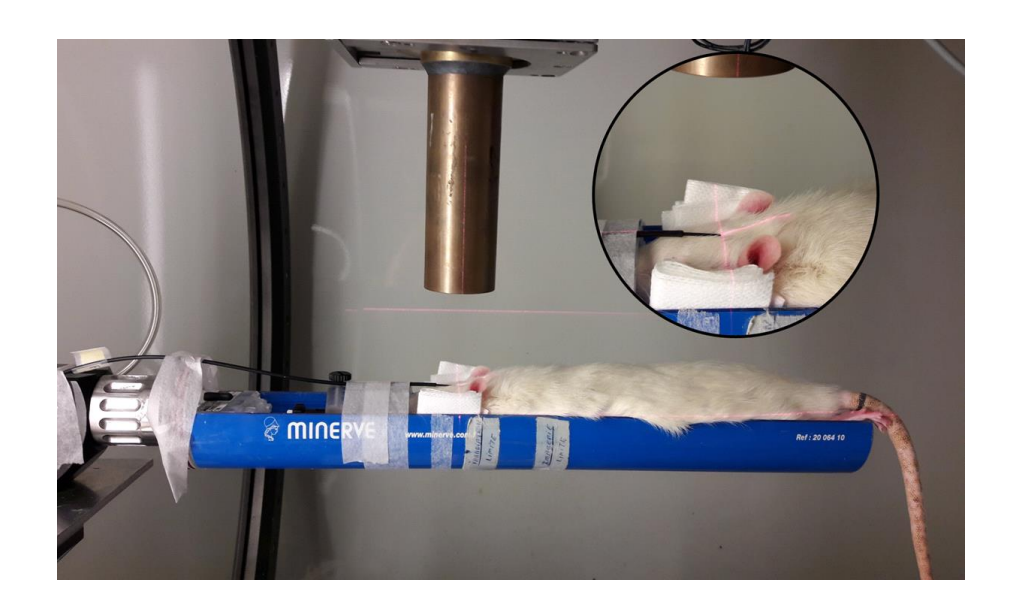
Figure 2. Irradiation of a rat brain and dose measurement by DosiRat positioned at the beam entrance, using the positioning lasers.

a tube current of 1.3 mA to avoid too short irradiation times. For the doses of 0.5 Gy, two tube currents (1.3 and 13 mA) were tested. Each irradiation was reproduced three times, the animal and the dosimeter being repositioned between each measurement in order to evaluate the whole dosimetry process reproducibility.