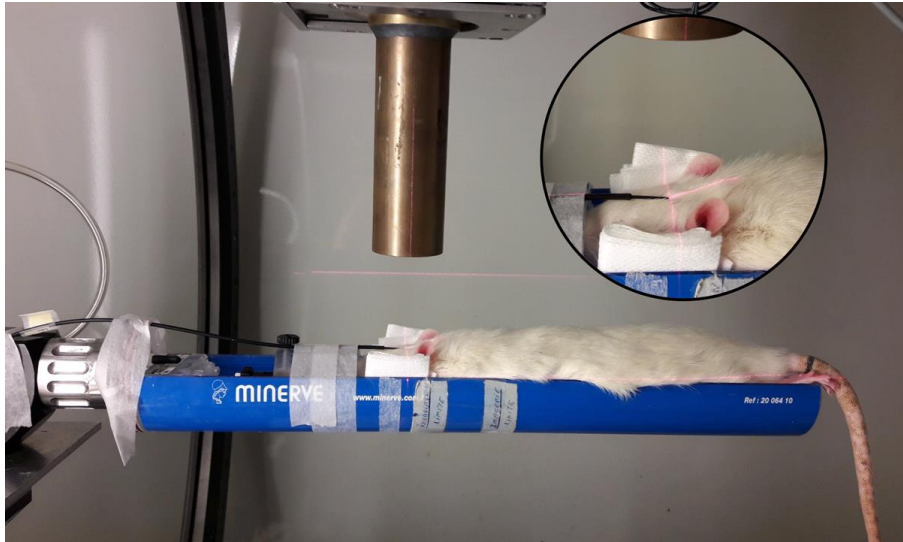
Figure 2. Irradiation of a rat brain and dose measurement by DosiRat positioned at the beam entrance, using the positioning lasers.

a tube current of 1.3 mA to avoid too short irradiation times. For the doses of 0.5 Gy, two tube currents (1.3 and 13 mA) were tested. Each irradiation was reproduced three times, the animal and the dosimeter being repositioned between each measurement in order to evaluate the whole dosimetry process reproducibility.