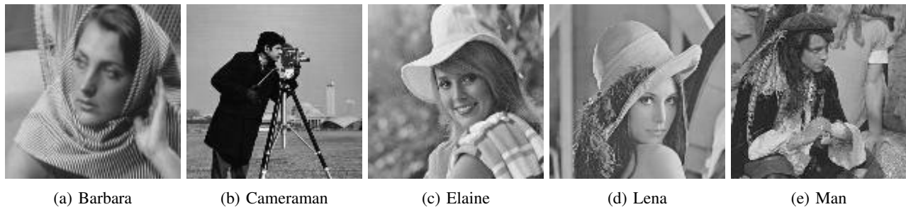
Fig. 1: Examples in the USC-SIPI Image Database