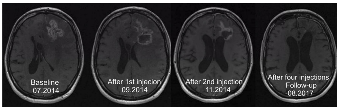
FIGURE 2 | In a 32-year-old woman suffering from an astrocytoma WHO grade II, conversion into a secondary Glioblastoma multiforme (GBM) manifested 10.6 months after initial diagnosis. Following standard treatment consisting of surgery, radiotherapy, and chemotherapy with temozolomide, four cycles of ^{213}\text{Bi} -DOTA-substance P were applied. The total activity injected amounted to 8.0 GBq of the therapeutic isotope. The T1-weighted enhanced MRI examination revealed shrinkage of the tumor by 32% (Krolicki et al., 2018).

Chlorotoxin is a 36-amino-acid neurotoxin present in the highly toxic venom of the giant yellow Israeli scorpion ( Leiurus