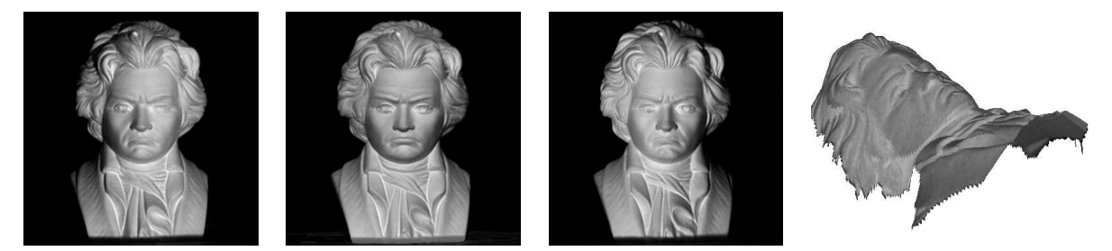
Figure 2. 3D-reconstruction using uncalibrated PS. Left: the m = 3 input images, with unknown illuminations. Right: 3D-reconstruction, with estimated albedo warped onto the reconstructed surface.

If no information about the illumination is available, it is usually assumed that the lightings are directional. This hypothesis is for example systematically introduced in uncalibrated PS (unknown illuminations), so as to simplify the image graylevel model and to allow efficient resolution through matrix factorisation techniques.<sup>4</sup>