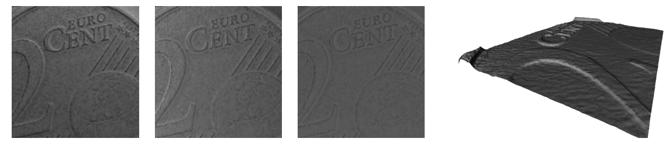
Figure 5. 3D-reconstruction using PS with complex primary lightings. Left: 3 of the m = 15 input images. In each image, the scene is illuminated by a combination of primary and secondary illuminants (LEDs and their reflections inside the device), which is sampled by introducing a planar calibration grid, before interpolation. Right: 3D-reconstruction. Both high- and low-frequency details are finely recovered.

We then find ourselves in the standard calibrated PS case, which does not require any iterative procedure, since the model is linear w.r.t. m = \rho \mathbf{n} . Eventually, the 3D-points can be estimated by integrating the estimated normals. In Figure 5, we show the results of applying this approach to images captured using a dermoscopy device (a high-focal camera usually intended to observe the skin). Microstructures of a painted (so as to remove the specularities) 2-cents euro coin are revealed, while the 3D-reconstruction also exhibits an accurate 3D-reconstruction of low-frequencies, thanks to the appropriate dense calibration of the lightings.