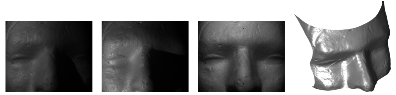
Figure 3. 3D-reconstruction of a polystyrene dummy using PS with isotropic punctual sources. Left: 3 of the m = 10 input images. In each image, a single nearby LED with known position and intensity is used to illuminate the scene. Right: 3D-reconstruction.

The directional assumption above is not realistic when dealing with nearby sources, such as LEDs at short distance. A punctual model (Figure 1-a), with known position \mathbf{x}_{\mathcal{S}} (extension to unknown \mathbf{x}_{\mathcal{S}} was recently proposed in Ref. 11), is more appropriate than a directional model. In this case, the light direction \mathbf{u}_e writes: