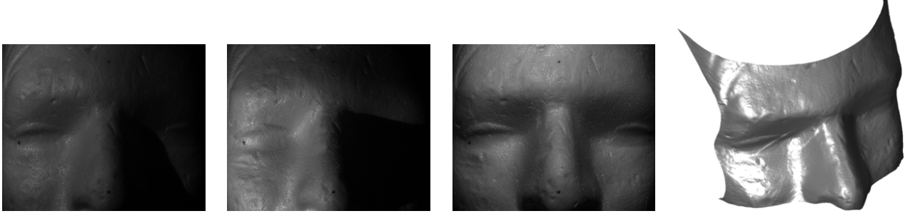
Figure 3. 3D-reconstruction of a polystyrene dummy using PS with isotropic punctual sources. Left: 3 of the m = 10 input images. In each image, a single nearby LED with known position and intensity is used to illuminate the scene. Right: 3D-reconstruction.

The directional assumption above is not realistic when dealing with nearby sources, such as LEDs at short distance. A punctual model (Figure 1-a), with known position \mathbf{x}_S (extension to unknown \mathbf{x}_S was recently proposed in Ref. 11), is more appropriate than a directional model. In this case, the light direction \mathbf{u}_e writes: