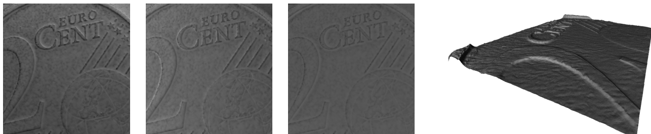
Figure 5. 3D-reconstruction using PS with complex primary lightings. Left: 3 of the m = 15 input images. In each image, the scene is illuminated by a combination of primary and secondary illuminants (LEDs and their reflections inside the device), which is sampled by introducing a planar calibration grid, before interpolation. Right: 3D-reconstruction. Both high- and low-frequency details are finely recovered.

We then find ourselves in the standard calibrated PS case, which does not require any iterative procedure, since the model is linear w.r.t. m = \rho \mathbf{n} . Eventually, the 3D-points can be estimated by integrating the estimated normals. In Figure 5, we show the results of applying this approach to images captured using a dermoscopy device (a high-focal camera usually intended to observe the skin). Microstructures of a painted (so as to remove the specularities) 2-cents euro coin are revealed, while the 3D-reconstruction also exhibits an accurate 3D-reconstruction of low-frequencies, thanks to the appropriate dense calibration of the lightings.