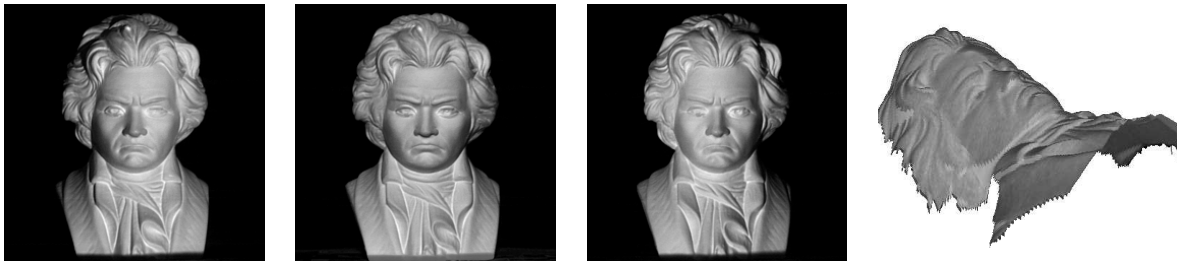
Figure 2. 3D-reconstruction using uncalibrated PS. Left: the m = 3 input images, with unknown illuminations. Right: 3D-reconstruction, with estimated albedo warped onto the reconstructed surface.

If no information about the illumination is available, it is usually assumed that the lightings are directional. This hypothesis is for example systematically introduced in uncalibrated PS (unknown illuminations), so as to simplify the image graylevel model and to allow efficient resolution through matrix factorisation techniques. 4