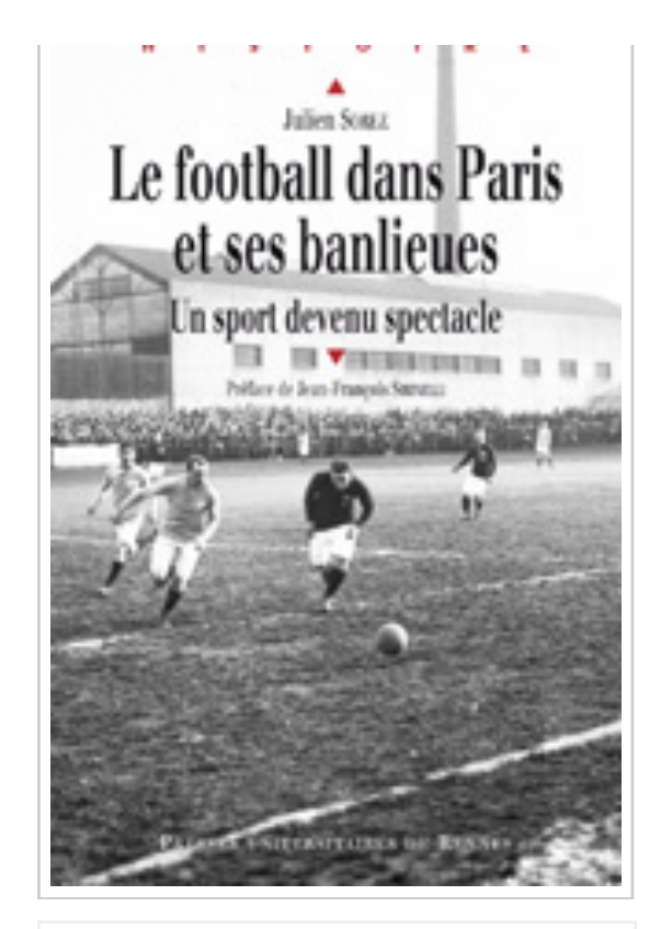
Presses universitaires de Rennes, 2013