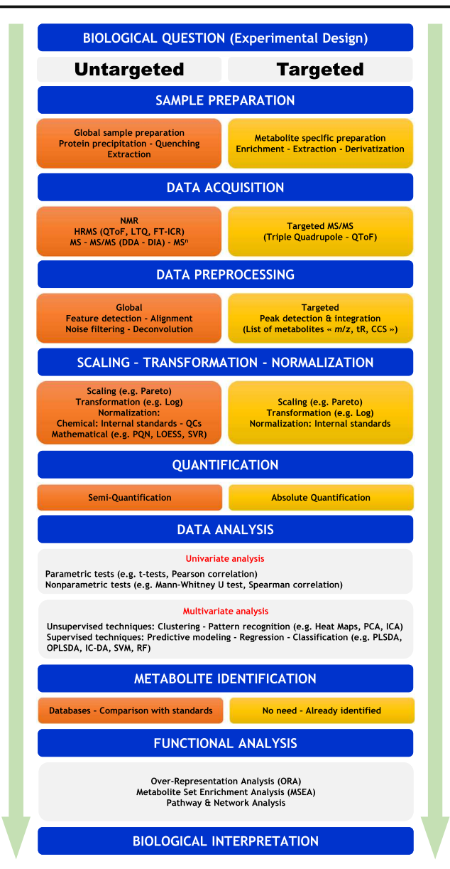
Fig. 1 General metabolomics workflow. Metabolomics is divided into two main strategies. A targeted metabolomics is a quantitative analysis or a semiquantitative analysis of a set of metabolites that might be linked to common chemical classes or a selected metabolic pathway. An untargeted metabolomics approach is primarily based on the qualitative or semiquantitative analysis of the largest possible number of metabolites from diverse chemical and biological classes contained in a biological sample. The generated data undergo data analysis step (univariate and multivariate) and functional analysis to get actionable biological insight

sample preparation protocols. It should be noted that most metabolomics studies are intrinsically comparative; therefore, a group of control samples (samples that did not undergo the investigated condition) and test samples (samples exposed to the investigated condition) are rigorously defined in the experimental design with clear inclusion and exclusion criteria (Broadhurst and Kell 2006). Indeed, subjects are heterogeneous with respect to demographic and lifestyle factors, and this factor is especially important in defining healthy controls.