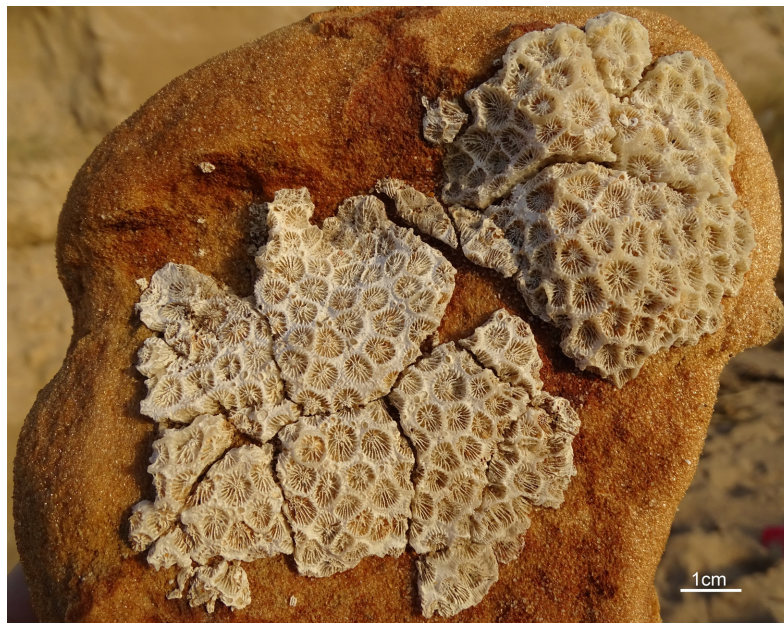
FIG. 1. A large colony of the scleractinian coral Astrangia poculata found on polyurethane substrate at Biville beach, Normandy, France, January 2018.

It appears that the stranding of A. poculata in the Netherlands is less unique than originally thought since recent beachcombing activities have resulted in an additional discovery in the East Atlantic. On 14 January 2018, 11 d after storm Eleanor, a dead, fragmented coral colony (diameter 13 cm) was found on a large piece of polyurethane foam at Biville beach (50° N 02° W), Normandy, France (Fig. 1). Originally, the plastic raft could have served as light-weight filling material inside a boat hull or as the interior part of a buoy. It is unknown whether the coral was still alive when it beached and for how long it had been floating around before it was found. The raft was abraded and some parts of the coral colony were gone. Three coral fragments have been deposited in the reference collection of Naturalis Biodiversity Center (catalogue nr. RMNH COEL. 42326).