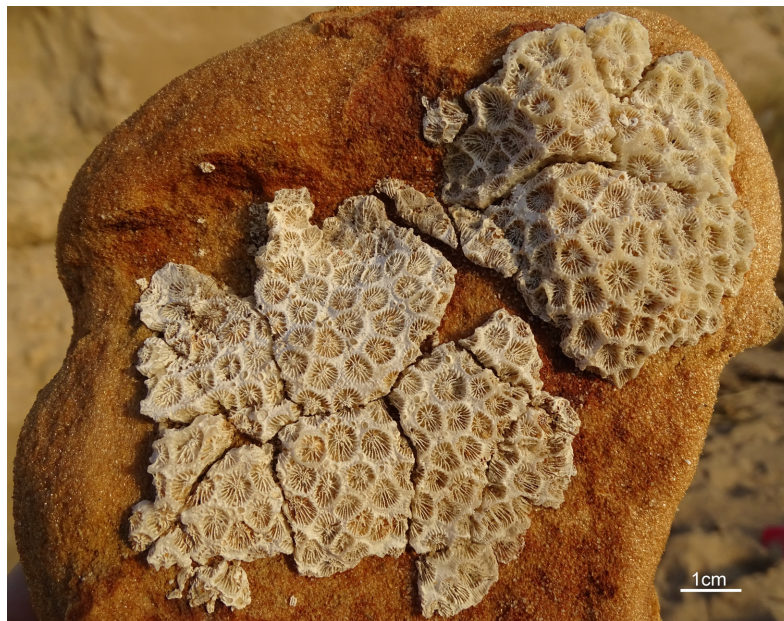
FIG. 1. A large colony of the scleractinian coral Astrangia poculata found on polyurethane substrate at Biville beach, Normandy, France, January 2018.

It appears that the stranding of A. poculata in the Netherlands is less unique than originally thought since recent beachcombing activities have resulted in an additional discovery in the East Atlantic. On 14 January 2018, 11 d after storm Eleanor, a dead, fragmented coral colony (diameter 13 cm) was found on a large piece of polyurethane foam at Biville beach (50° N 02° W), Normandy, France (Fig. 1). Originally, the plastic raft could have served as light-weight filling material inside a boat hull or as the interior part of a buoy. It is unknown whether the coral was still alive when it beached and for how long it had been floating around before it was found. The raft was abraded and some parts of the coral colony were gone. Three coral fragments have been deposited in the reference collection of Naturalis Biodiversity Center (catalogue nr. RMNH COEL. 42326).