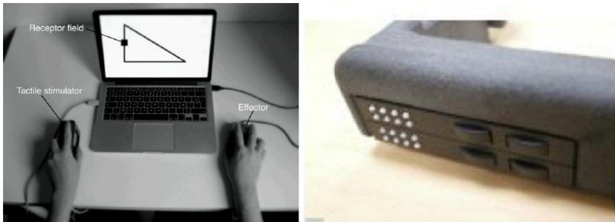
Figure 1 : Tactos device

The user moves a cursor with 16 receptor fields by means of an effector (i.e., a mouse). When one or more of these receptor fields encounter a black pixel on the screen, the corresponding tactile stimulators are activated (Figure 2).