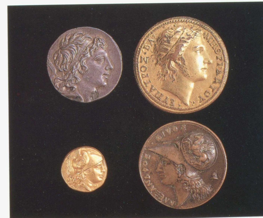
140f,g (top); d,e (bottom)