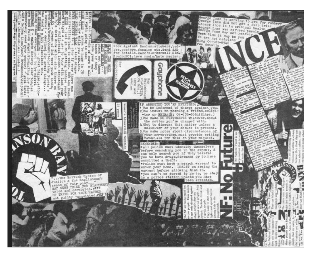
FIGURE ONE: ONE PAGE OF TRB BULLETIN N° 8, JANUARY 1978