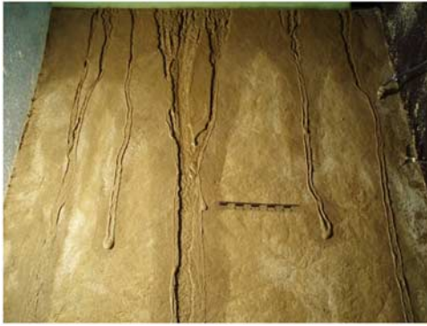
Figure 4. Narrow gullies with lateral levées and relatively small terminal lobes. The morphological characteristics of these gullies on silt are similar to those found in the Russell crater on Mars. The analogy with Figure 1 is striking. At the top sinuous channels occur on the rim crest. In the middle slope connections between gullies and the variation of their growth by successive waves of debris occur, resulting from several pulses of water from the rim crest.

linear gullies comparable to those seen on Mars (Figure 3). When active-layer thickness exceeded c. 5 mm, incision increases, resulting in a high quantity of transported material which then forms substantial accumulations (levées and terminal lobes). In this case, the large deposits inhibited the following flows which lead to the development of complex and non-linear gullies.